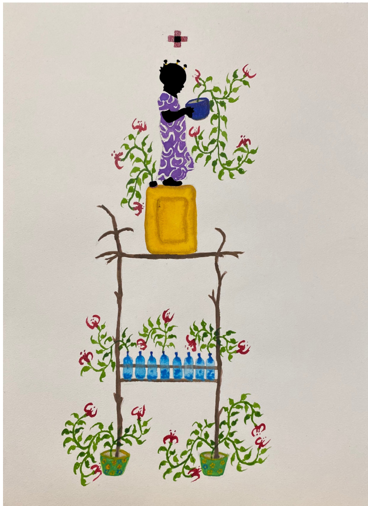
Above. Saïdou Dicko, L'Email , 2022. 40x30 cm. Watercolour on paper. Courtesy of AFIKARIS Gallery.

“In these studios, we had the freedom to choose between several backgrounds: several drawn landscapes, in nature with wild animals, etc. We had posters with skyscrapers in New York. There were a lot of possibilities. So that is also what I try to share through my photos.”