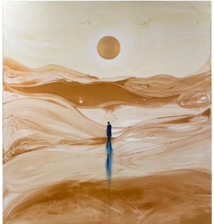
Omar Mahfoudi, Waiting in Merzouga , 2021. Acrylic and ink on canvas, 185 x 172 cm.

The movement of the dunes, which could also be seen as a choppy sea if not for the lone wonderer in its depths – contrasts with the stillness of the human form. Is the figure lost? Is it a ghost? Is it truly depicted, or is it imagined? Through these few visual clues, Mahfoudi, who seemingly invites his viewers into his own rêverie , in fact rouses them to create their own narrative, a golden desert of their own, an echo to their very own stories and approach to the world.