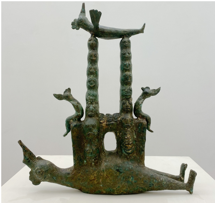
Hervé Yamguen. Les veilleurs , 2018 Bronze.

LES MONDES DE L'OISEAU CONTEUR Hervé Yamguen 3 February – 16 March