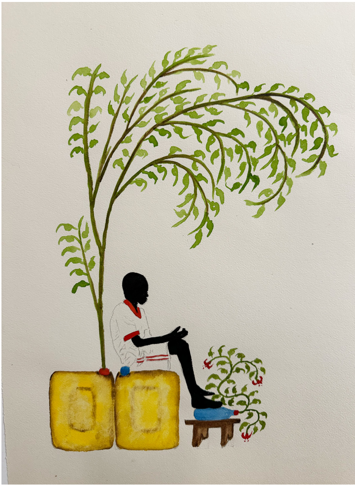
Above. Saïdou Dicko. Le tabouret , 2023. Watercolour on paper. 40x30 cm / 16x12 in.

On photographic paper, Saïdou Dicko covers the silhouettes of the children with black ink, transforming them into shadows. Becoming anonymous characters, their identity is limited only by their imagination. The world belongs to them. Behind them, the artist superimposes floral fabrics using his digital brushes, leaving only the main weave. The threads follow the movement of the figures, offering the stories an intimate and unique frame.