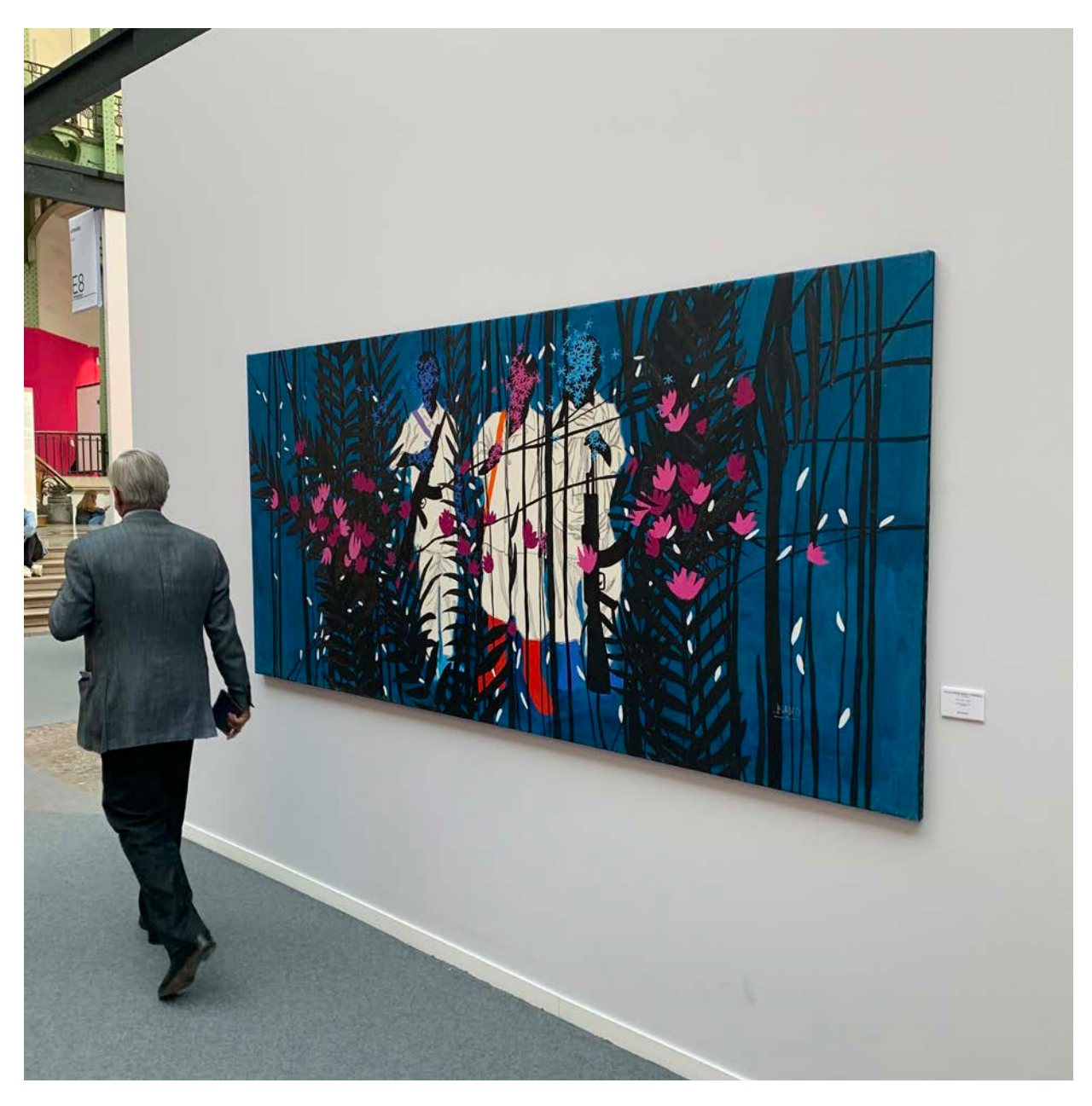
EXHIBITION VIEW Art Paris, AFIKARIS Gallery, Paris, France September 2020