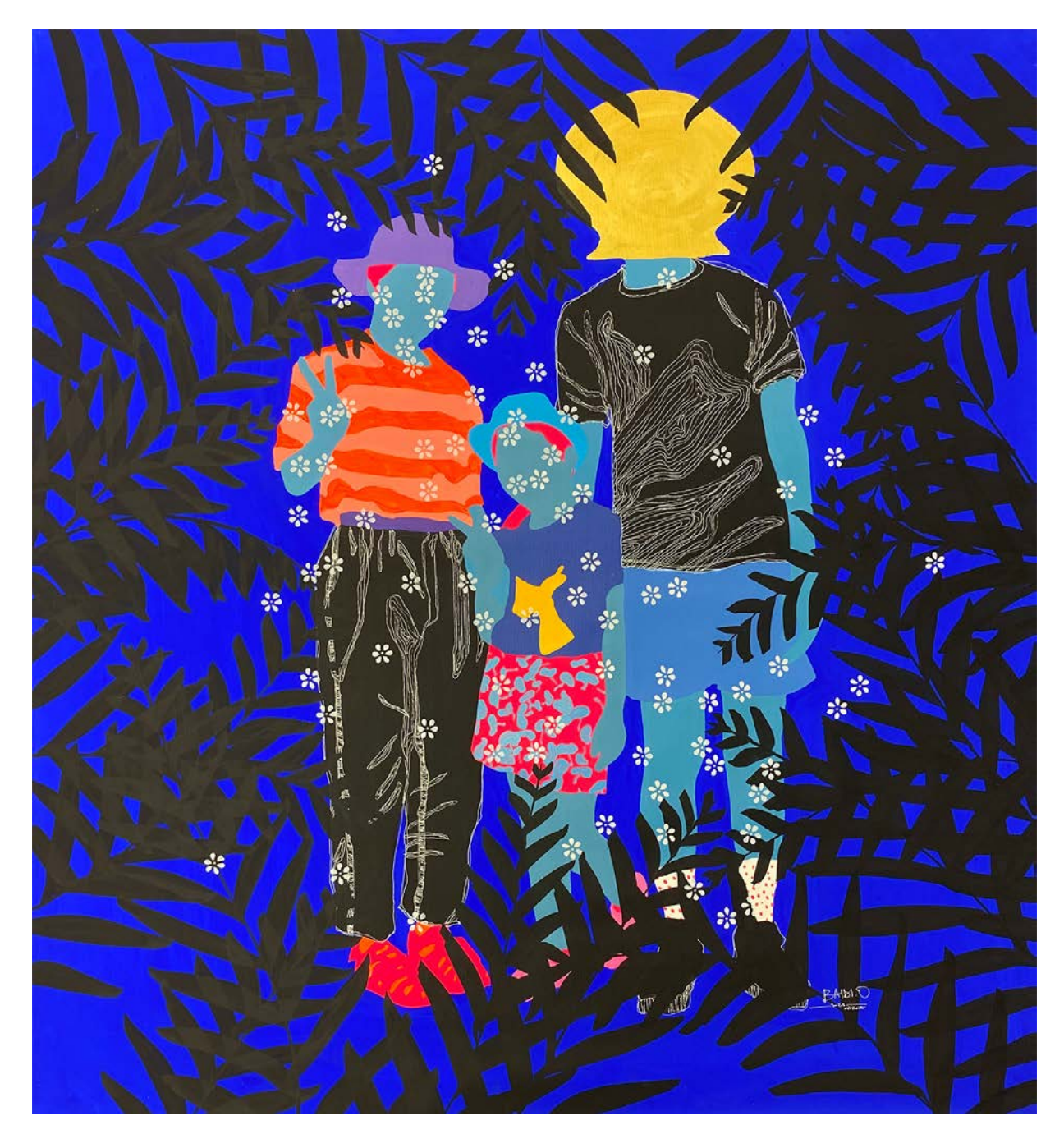
LE CHAPEAU DE L'HOMME DE LA FAMILLE , 2023 Acrylic and pen on canvas 140x130 cm / 55x51 in