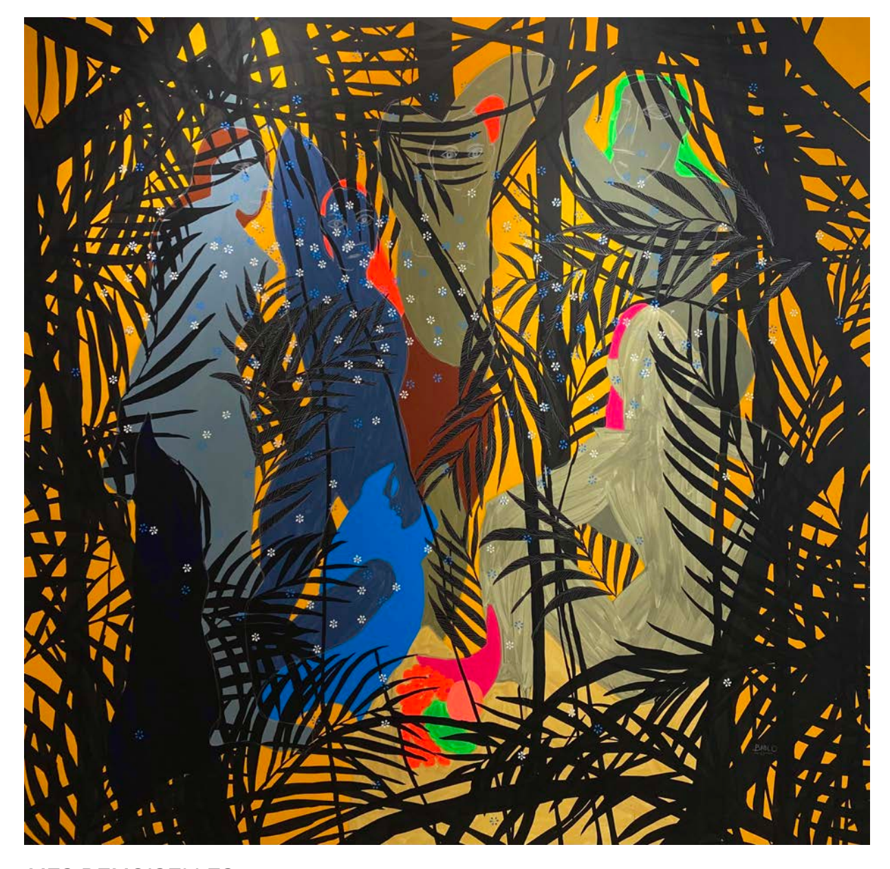
MES DEMOISELLES, 2022 Acrylic and pen on canvas 245x250 cm / 96x98 cm

Emerging from a curtain of leaves and branches that reveals and hides them at the same time, Moustapha Baidi Oumarou figures are as intriguing as in Picasso's Demoiselles d'Avignon. Their sensuality is underlined by the neon hues of their hair, echoing the colour of the fruits in the foreground, attributes of an explicit eroticism. The reinterpretation by Baidi Oumarou creates a mirror work that transports the characters to another environment, risking a certain malleability of a classic that was itself born of a synergistic work mixing multiple cultural and artistic impacts. For Baidi Oumarou, this artistic appropriation seems to express both a fascination for the original work and a desire to assert himself in his own art by transforming Les Demoiselles d'Avignon into 'his' Demoiselles.