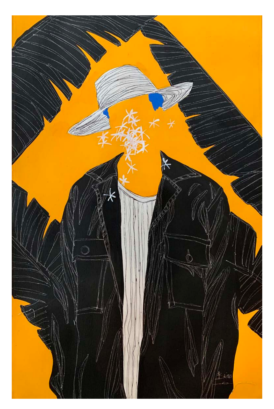
PORTRAIT X, 2020 Acrylic and ink on canvas 100x60 cm / 39x24 in