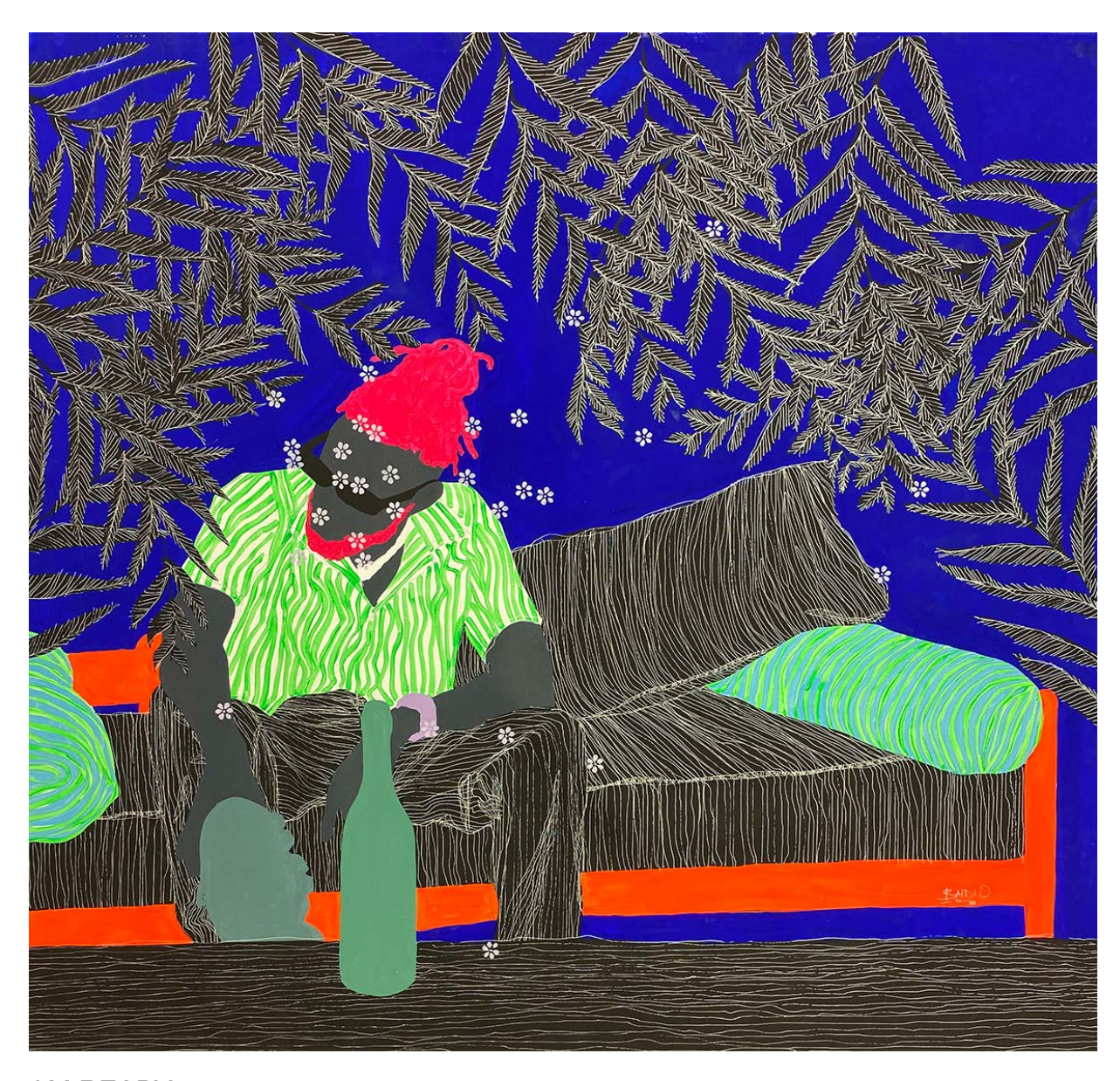
I'M READY, 2023 Acrylic and pen on canvas 140x150cm / 55x59 in