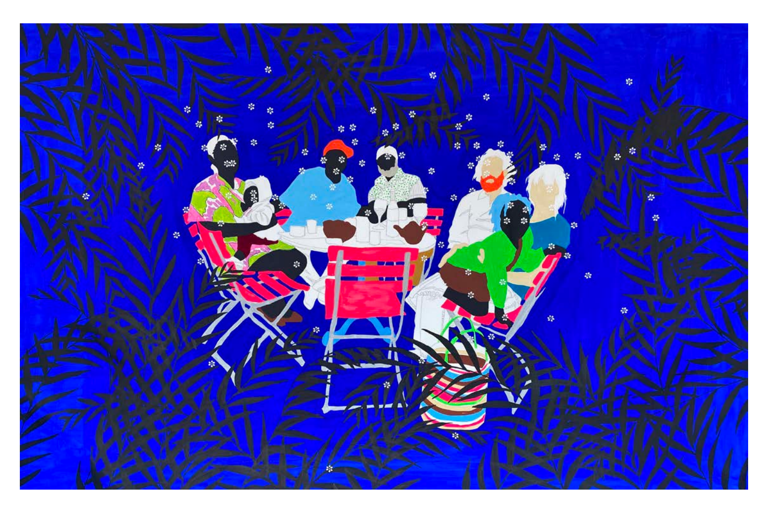
VACANCES EN FAMILLE, 2022 Acrylic and pen on canvas 200x300 cm / 79x118 in