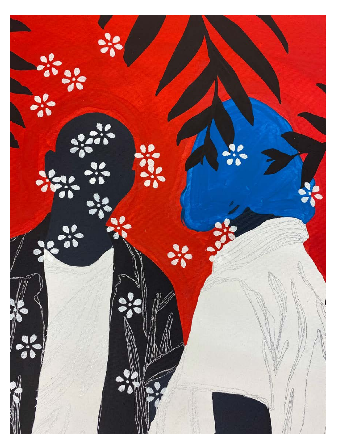
HORS MURS, 2019 (DETAIL)