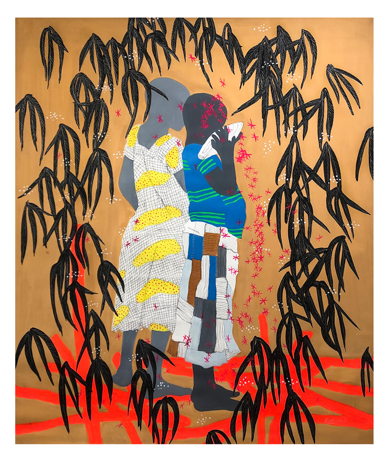
PARADIGME, 2021 Acrylic and posca on canvas 180x150 cm / 71x59 in