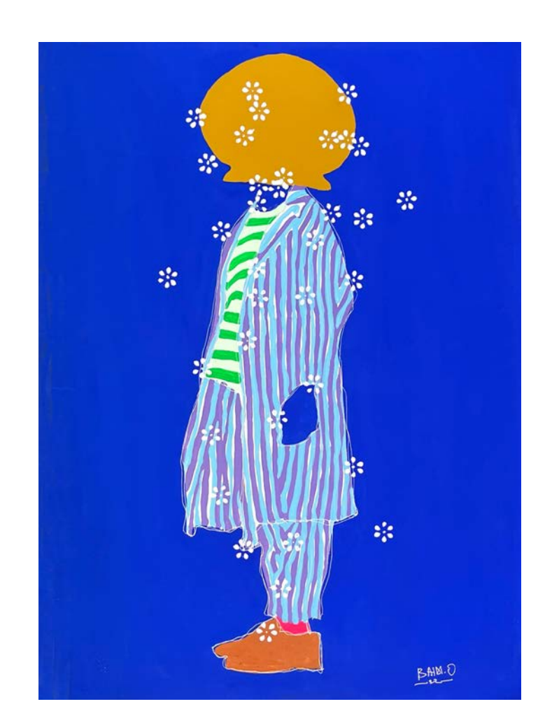
LEFT NDER TSHOURA AM 1, 2022 Acrylic and pen on canvas 85x60 cm / 33x24 in

RIGHT NDER TSHOURA AM 2, 2022 Acrylic and pen on canvas 85x60 cm / 33x24 in