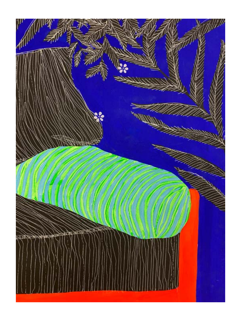
I'M READY , 2023 (DETAILS)