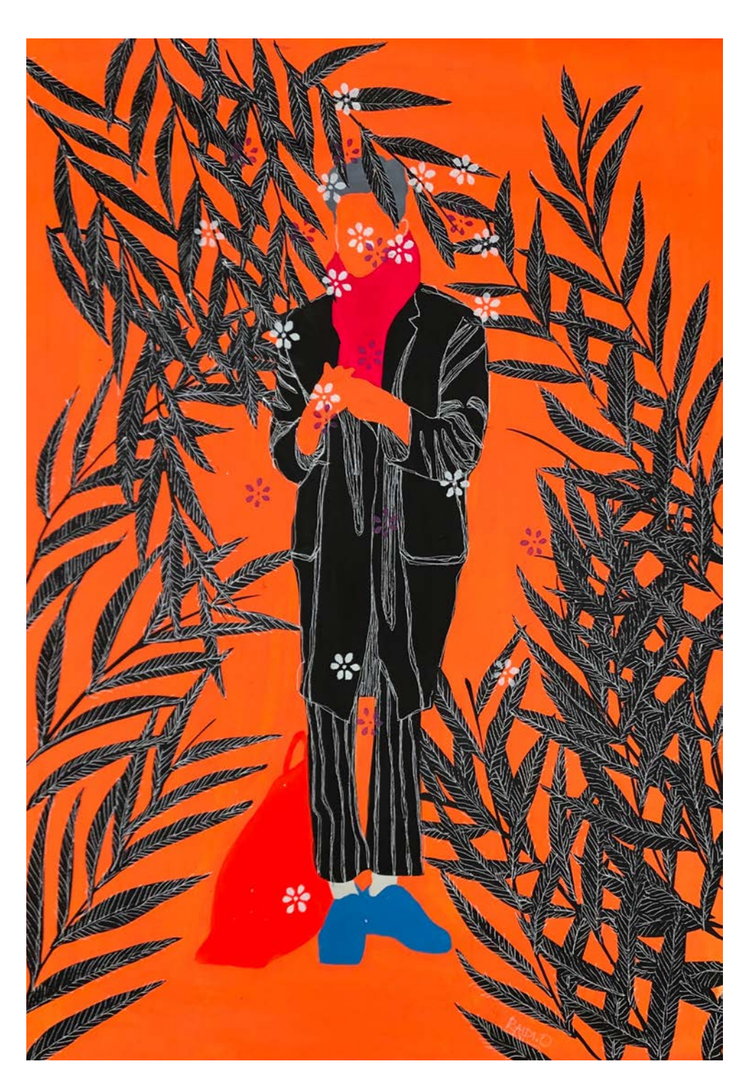
UNTITLED #2, 2021 Acrylic and posca on canvas 110x75 cm / 43x30 in