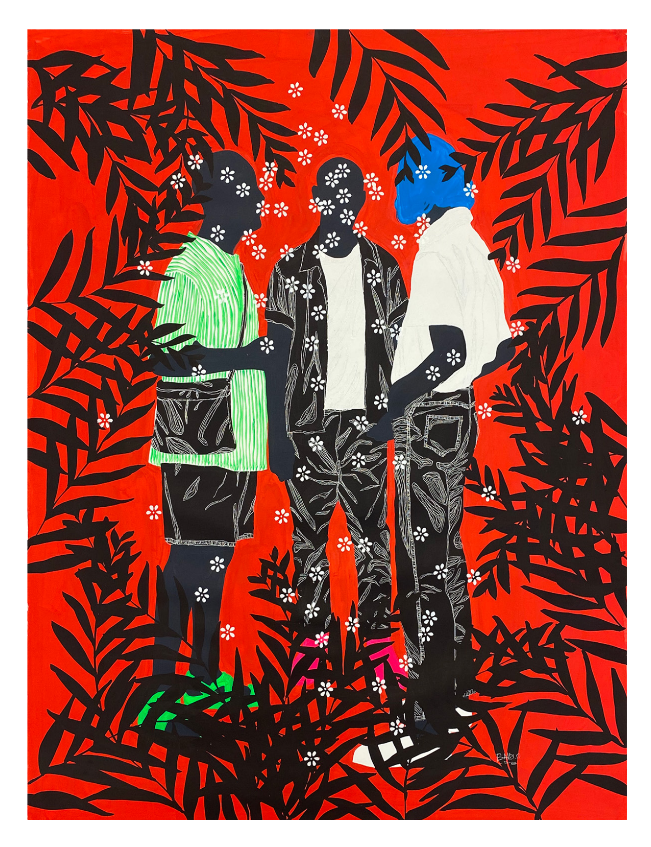
HORS MURS, 2019 Acrylic and pen on canvas 130x105 cm / 51x41 in