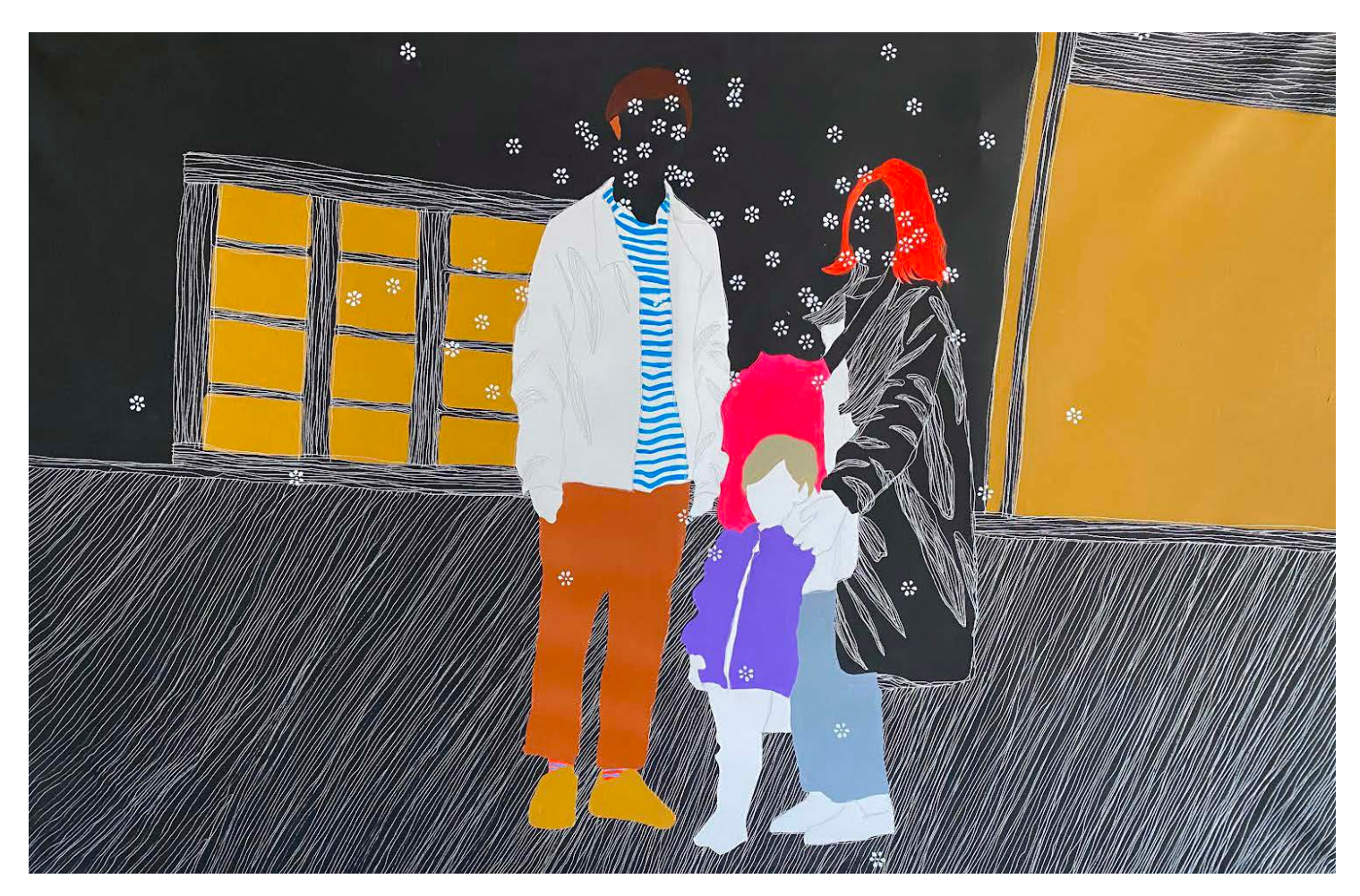
RÊVE D'UNE VIE, 2022 Acrylic and posca on canvas 120x180 cm / 47x71 in