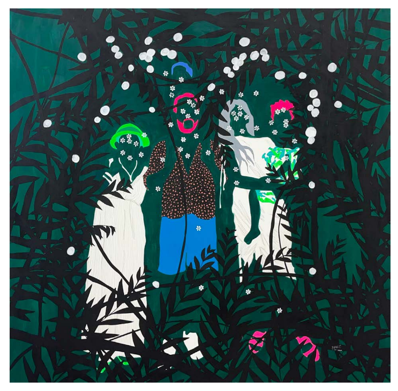
L'EDEN, 2023 Acrylic and pen on canvas 200x200 cm / 79x79 in