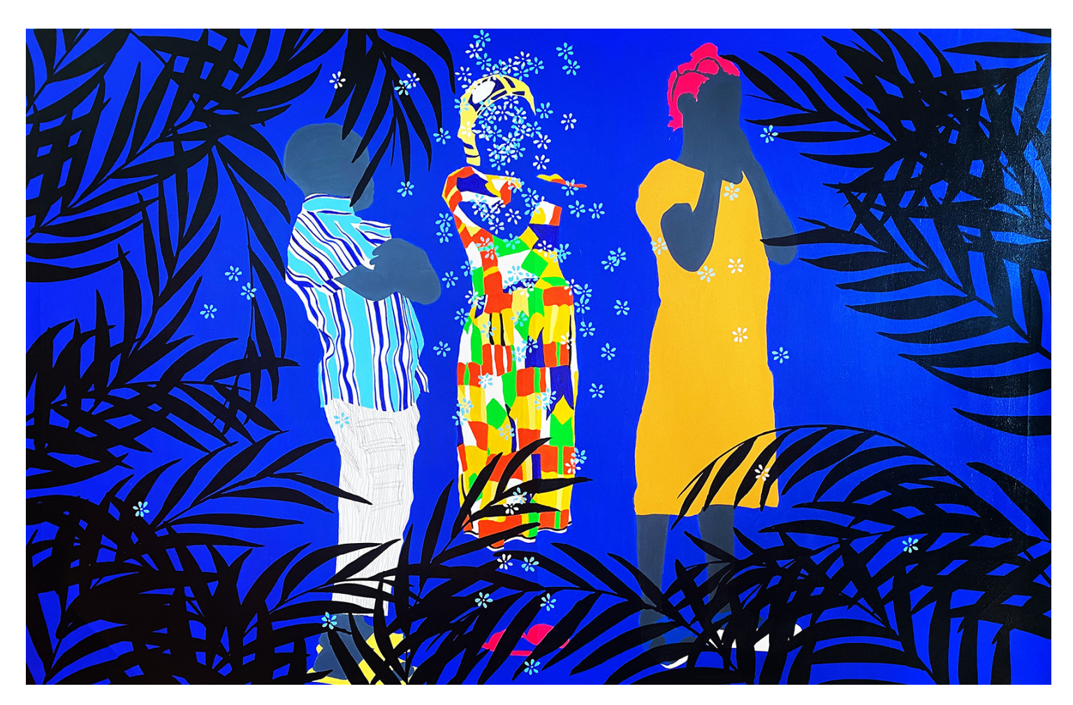
L'ÉLU , 2020 Acrylic and posca on canvas 120x180 cm / 47x71 in

In the middle of dense vegetation, Baidi Oumarou's fashionable outlines are deepened into nature. The natural elements the young painter introduces in his works contribute to the universality of his pacifist message. He specifies: "My characters represent the 'flower boy'. They embody moments of humanity, moments of joy and pictures of love."