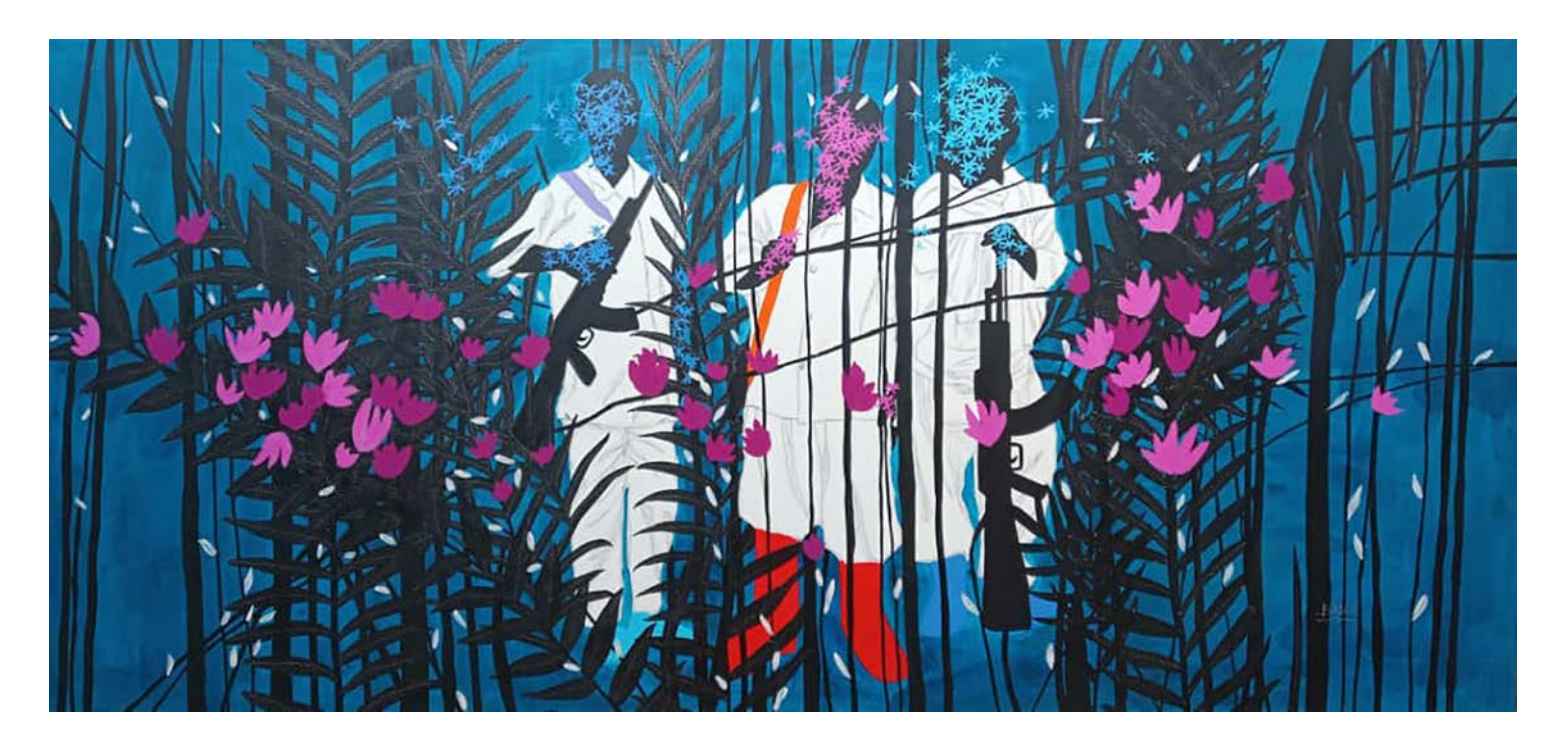
MON UNIVERS, 2019 Acrylic and ink on canvas 130x287 cm / 51x113 in

If at first sight the monumental canvas Mon Univers by Moustapha Baidi Oumarou seems to depict child soldiers, its genesis is quite different. Beyond depicting the fate of these children, he teaches us a lesson of bravery. He highlights the fight of these young children living in the street. The guns they are holding, more than being actual weapons, are a metaphor for their struggle and their determination to go beyond their sufferings to seek a better life.