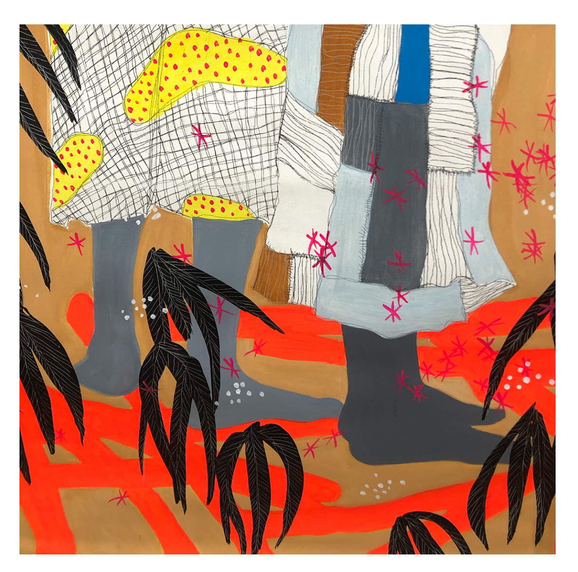
PARADIGME, 2021 (DETAIL)