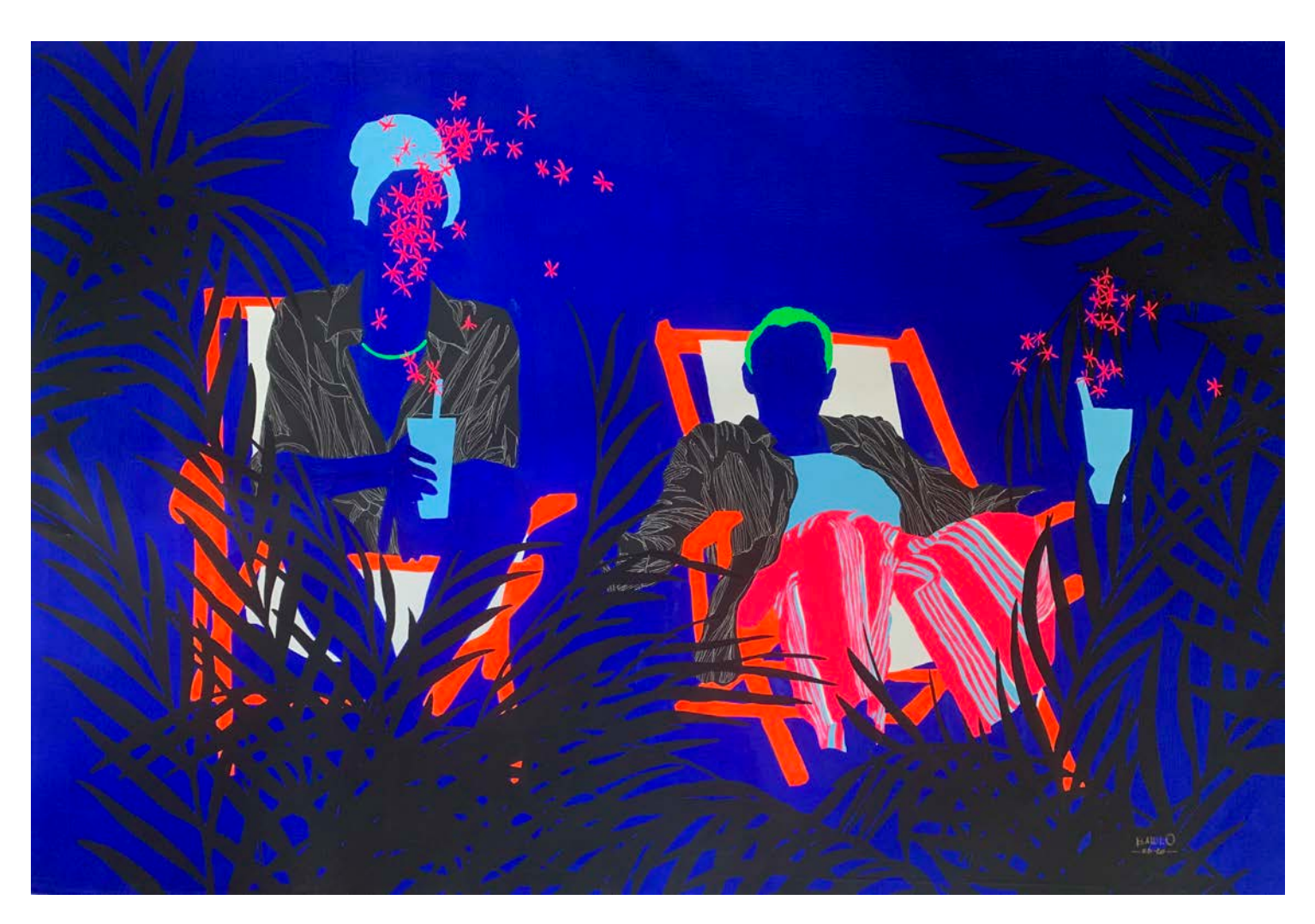
COCKTAIL D'AMOUR, 2020 Acrylic and posca on canvas 120x180 cm / 47x71 in