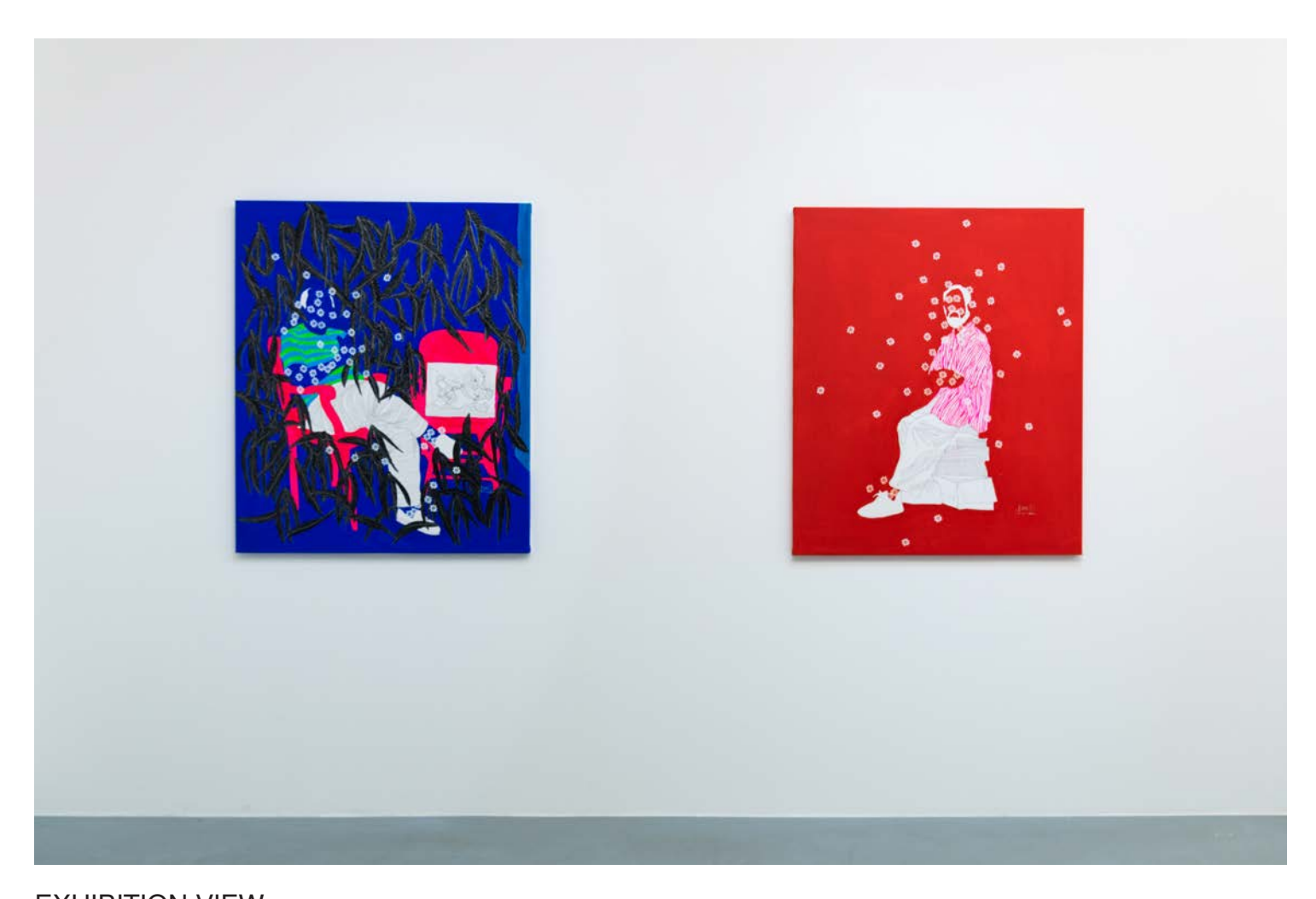
EXHIBITION VIEW Après la pluie, AFIKARIS Gallery, Paris, France November 2022