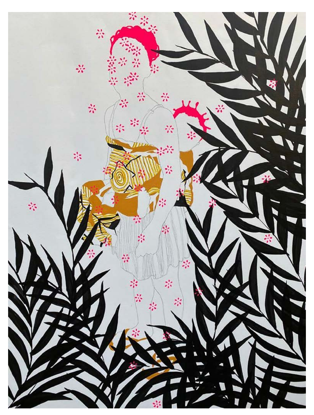
JEUNE MÈRE, 2020 Acrylic and posca on canvas 130x100 cm / 51x39 in