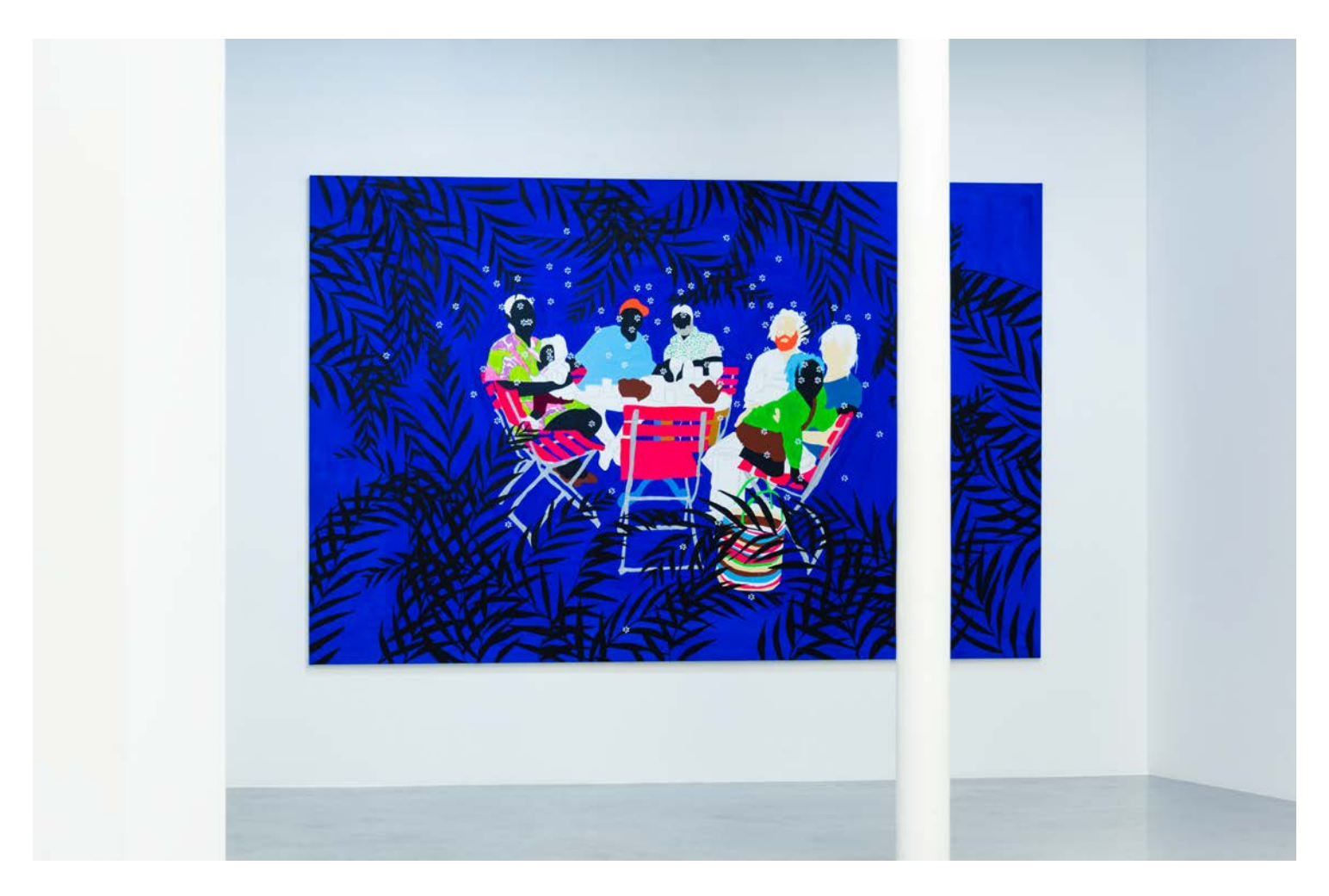
EXHIBITION VIEW Après la pluie, AFIKARIS Gallery, Paris, France November 2022