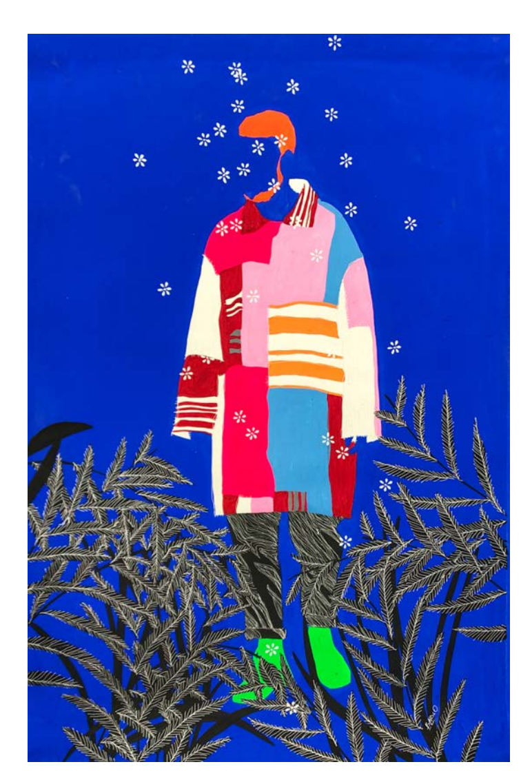
LEFT PAS DE TITRE, 2021 Acrylic and posca on canvas 150x100 cm / 59x39 in

RIGHT UNTITLED 2021 Acrylic and posca on canvas 150x100 cm / 59x39 in