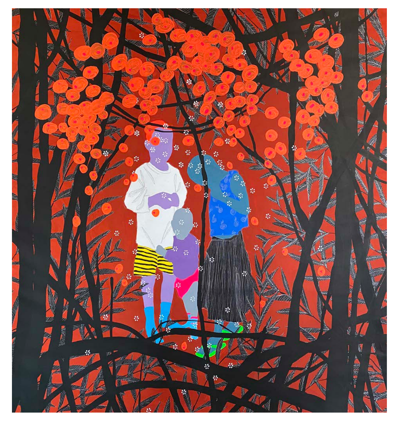
LES EXPLORATEURS, 2022 Acrylic and pen on canvas 200x200 cm / 79x79 in