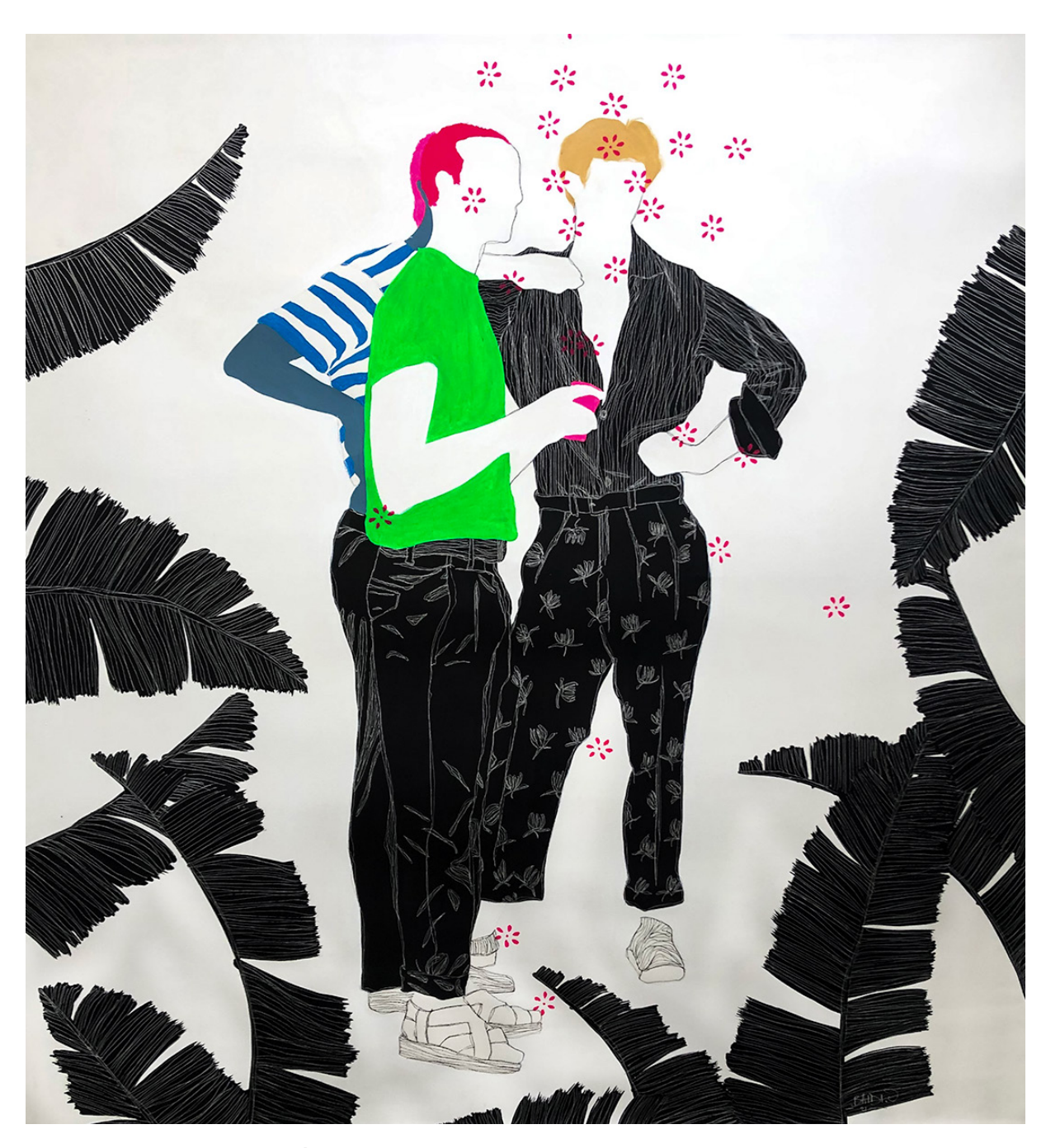
LE PARADIS DE L'APRÈS COVID, 2021 Acrylic and posca on canvas 140x130 cm / 55x51 in