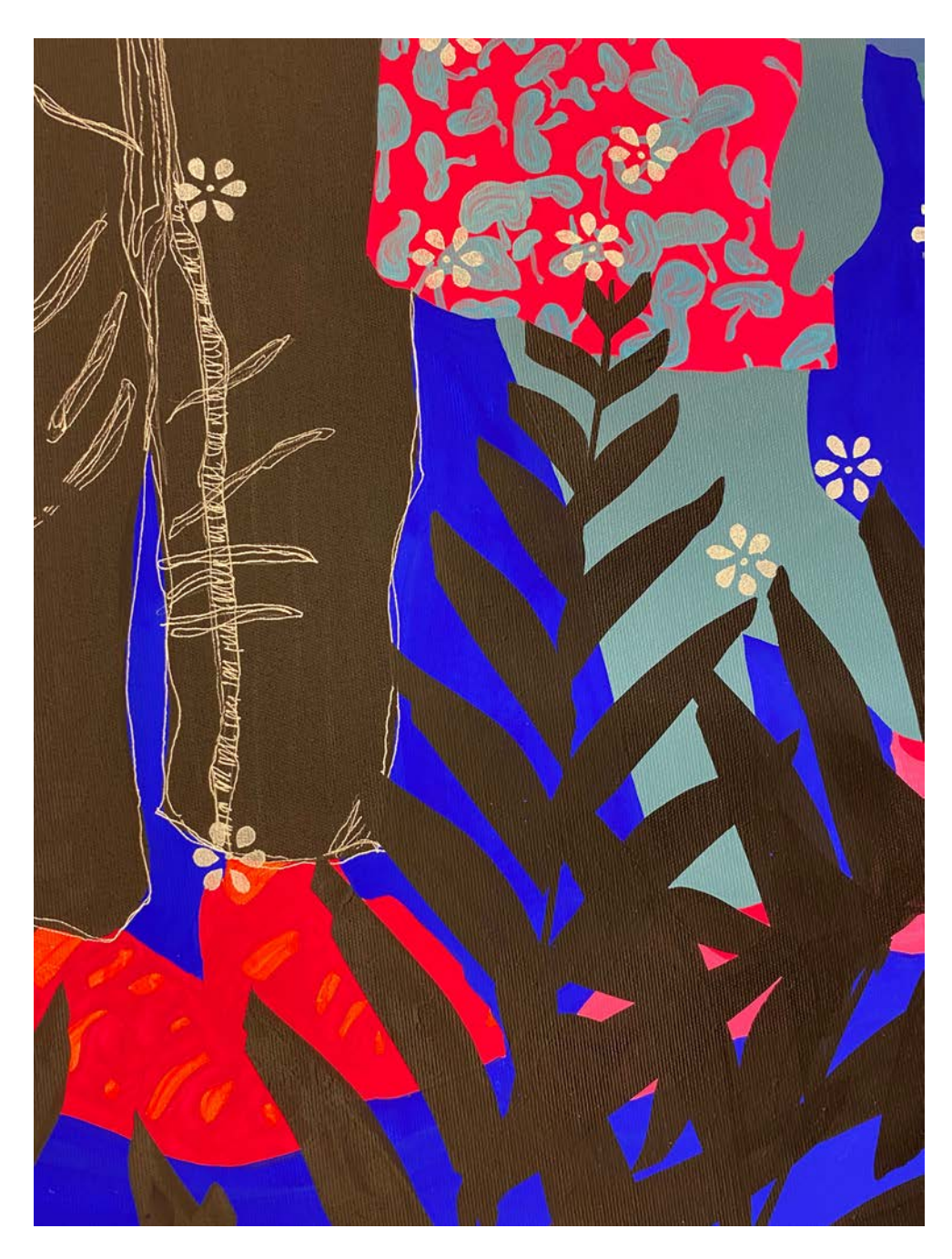
LE CHAPEAU DE L'HOMME DE LA FAMILLE , 2023 (DETAIL)