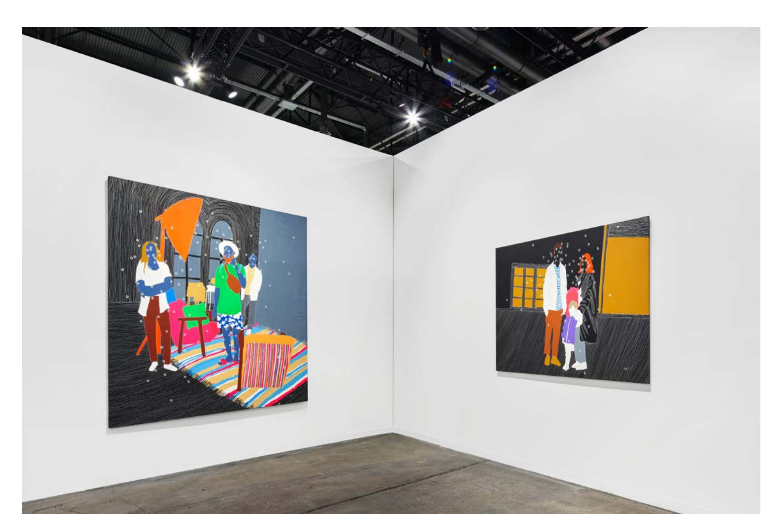
EXHIBITION VIEW Artgenève, AFIKARIS Gallery, Geneva, Switzerland March 2022