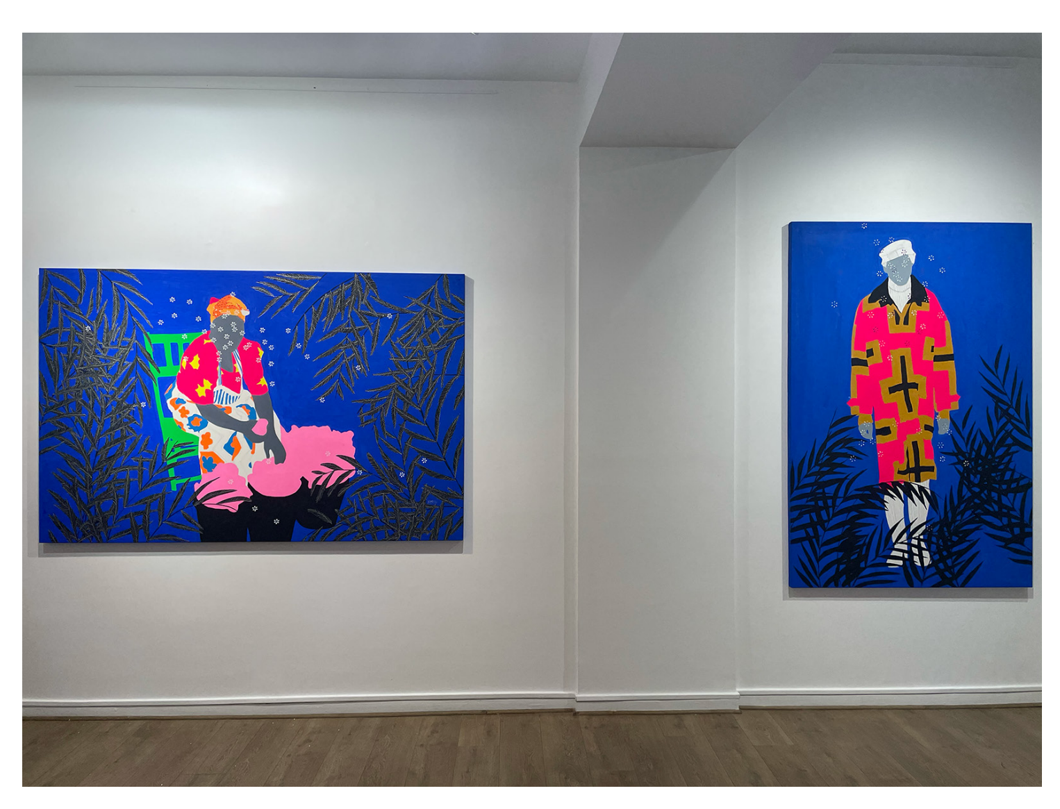
EXHIBITION VIEW Un monde bleu, AFIKARIS Gallery, Paris, France October 2022