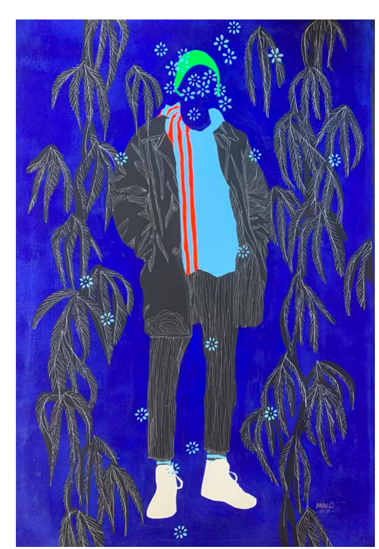
LEFT CONSCIOUS NATURE, 2020 Acrylic and posca on canvas 150x100 cm / 59x39 in

RIGHT MONDE BLEU, 2020 Acrylic and posca on canvas 150x100 cm / 59x39 in