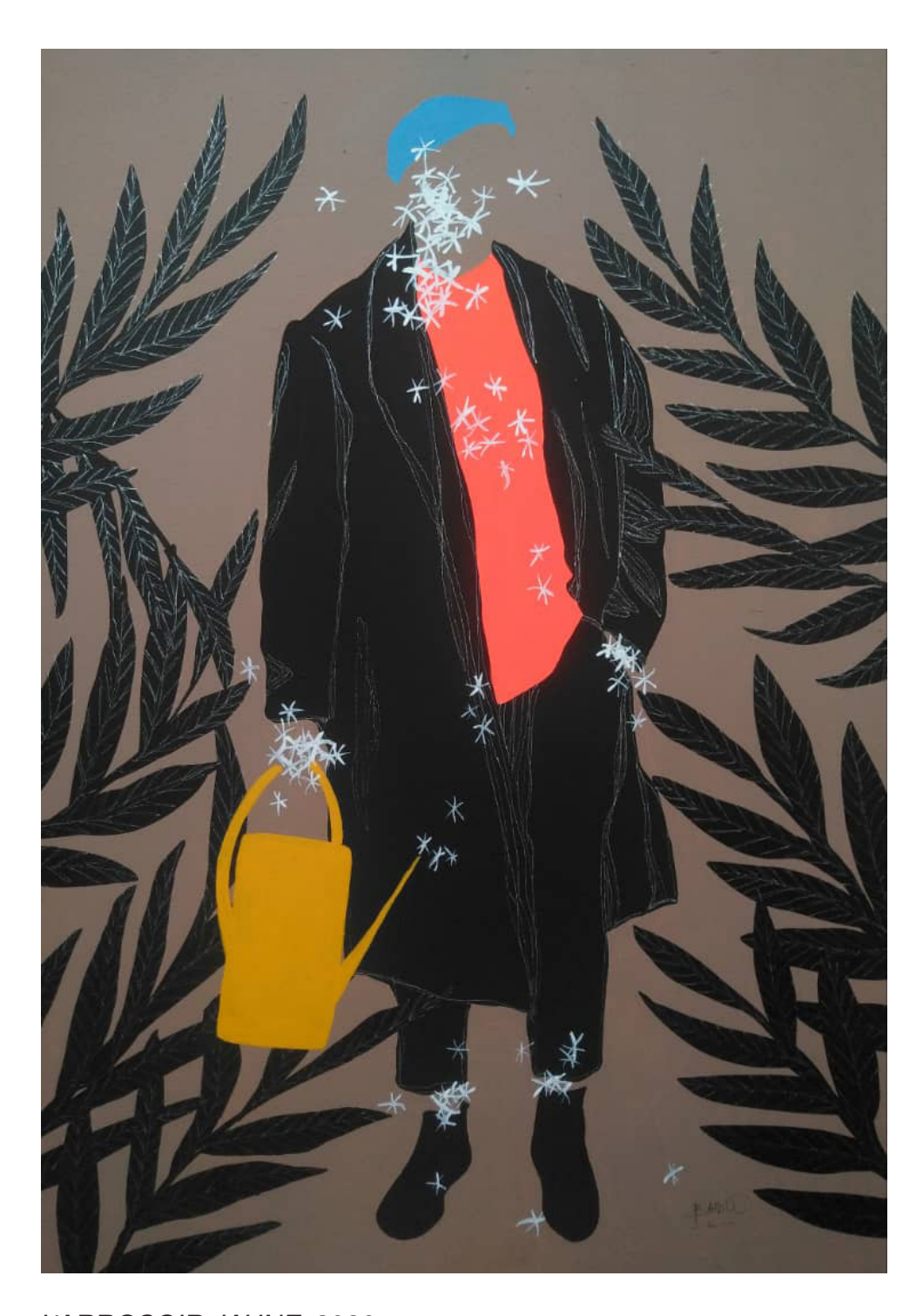
L'ARROSOIR JAUNE, 2020 Acrylic and ink on canvas 100x70 cm / 39x26 in