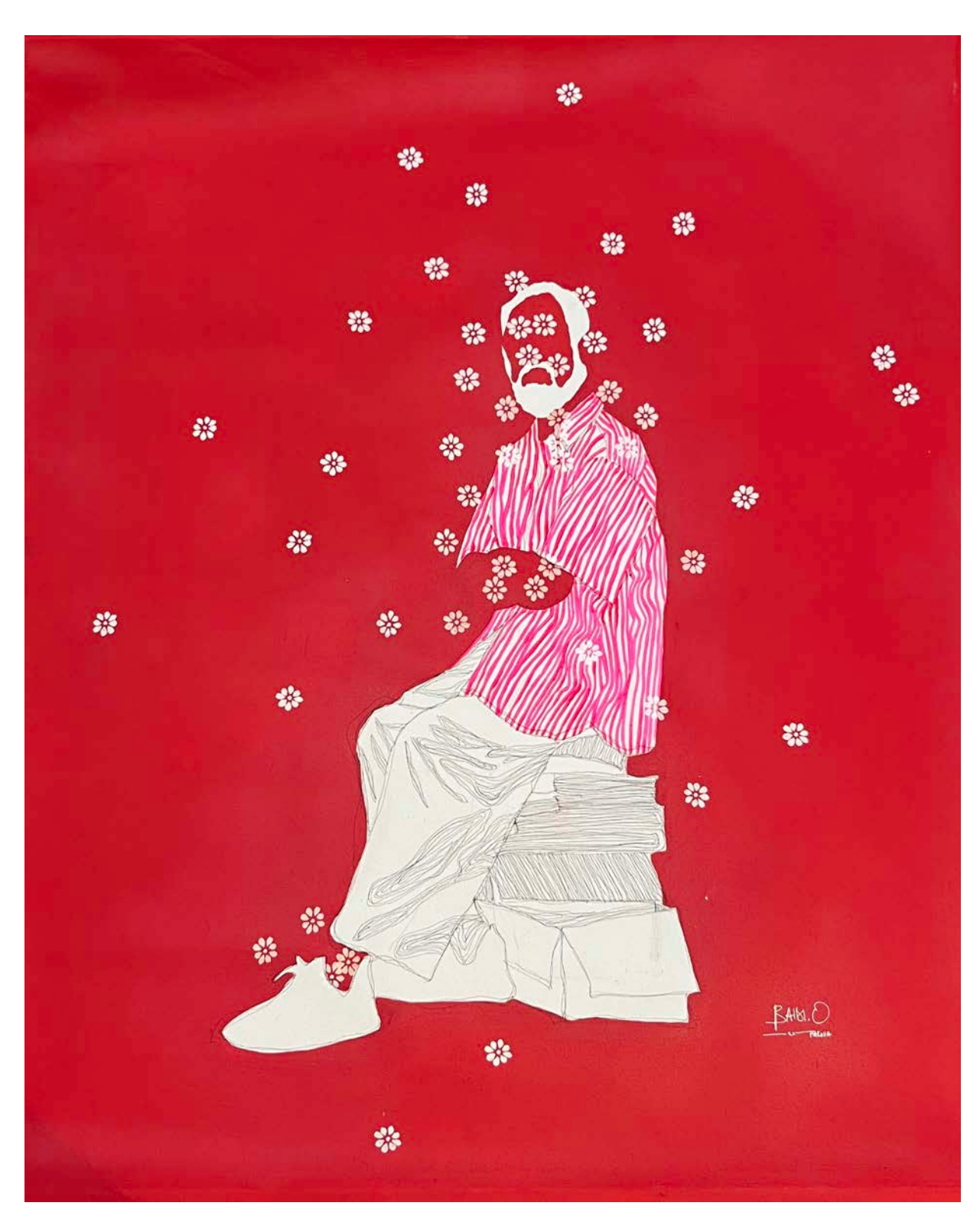
AU DESSUS DE NOS POUBELLES, 2022 Acrylic on canvas 120x100cm / 47x39 in