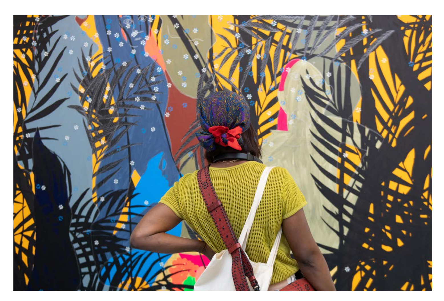
EXHIBITION VIEW Classique !, AFIKARIS Gallery, Paris, France July 2022