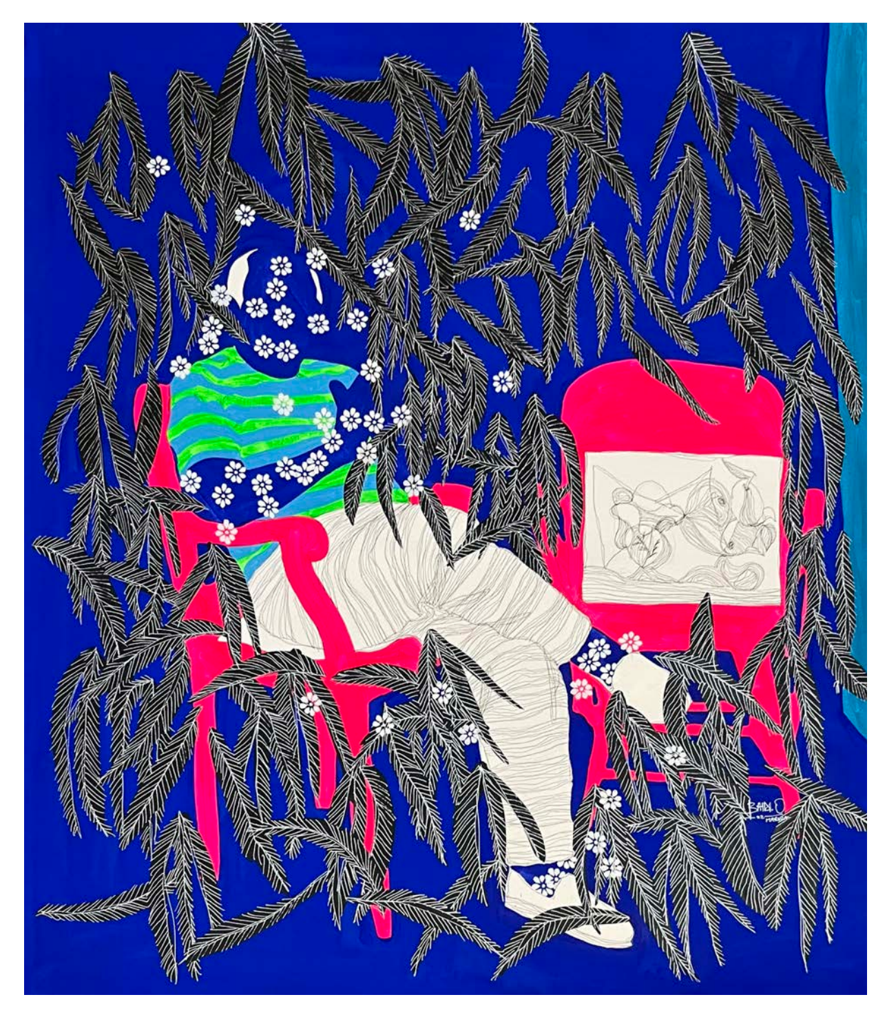
PICASSO EN ATELIER, 2022 Acrylic and pen on canvas 120x100 cm / 47x39 in

In the manner of Picasso - who appears in the work of Moustapha Baidi Oumarou, sitting in his studio, deep into his thoughts - he paints 'en réserve'. If the Harlequin (1923) by the Spanish master displays the genesis of its creation, the canvas left blank in the work of the Cameroonian artist brings respiration to the imposition of colour. It brings a breath. The artist plays with the composition and leaves room for the viewers' imagination. Their unconscious will colour the void, fed by their own expectations. In the same way, they will project themselves onto the anonymous silhouettes emerging from Baidi Oumarou's imaginary forests.