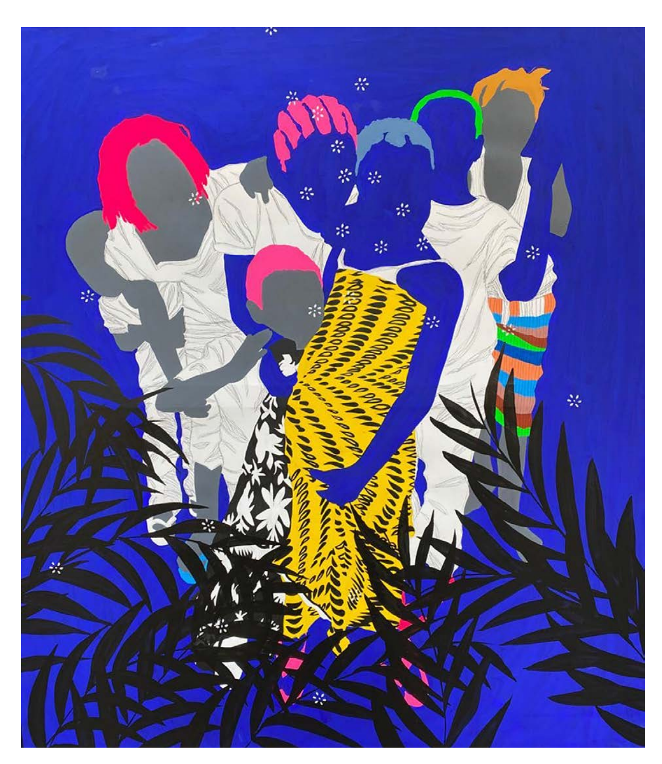
HISTORY, 2020 Acrylic and posca on canvas 140x130 cm / 55x51 in