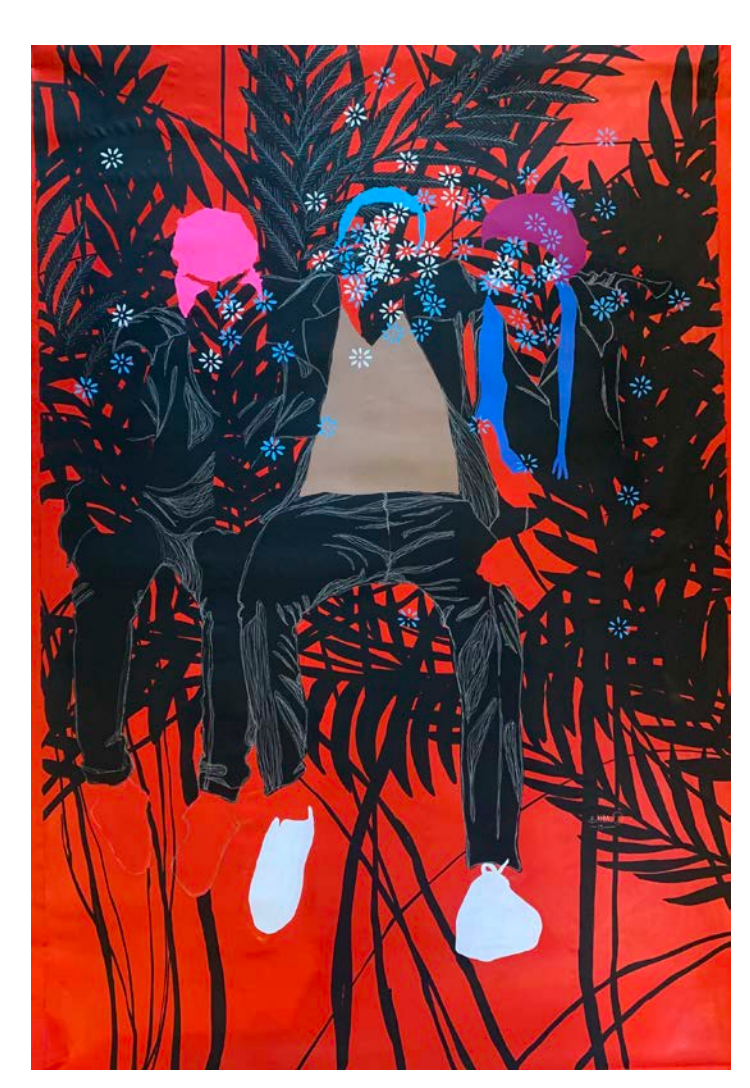
LEFT PORTRAIT D'AMIS, 2019 Acrylic and ink on canvas 180x120 cm / 71x47 in

RIGHT JEUX D'HUMEUR, 2019 Acrylic and ink on canvas 180x120 cm / 71x47 in