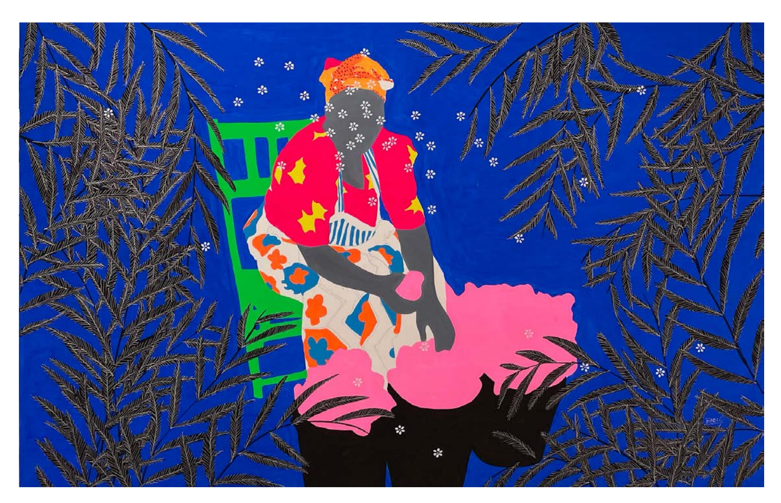
LOUMO PETEL, 2021 Acrylic and posca on canvas 120x180 cm / 47x71 in

Whilst blue is considered a cold colour associated with sorrow and nostalgia, for Moustapha Baidi Oumarou, blue evokes a dreamed and ideal world, in which the colour grows enshrined with a healing virtue. His works aim to make their viewer feel joy. They are an invitation to focus on the positive aspects of life. Thus, like the flower men who inhabit his work, blue carries and reflects on the humanist approach that characterizes his overall artistic language.