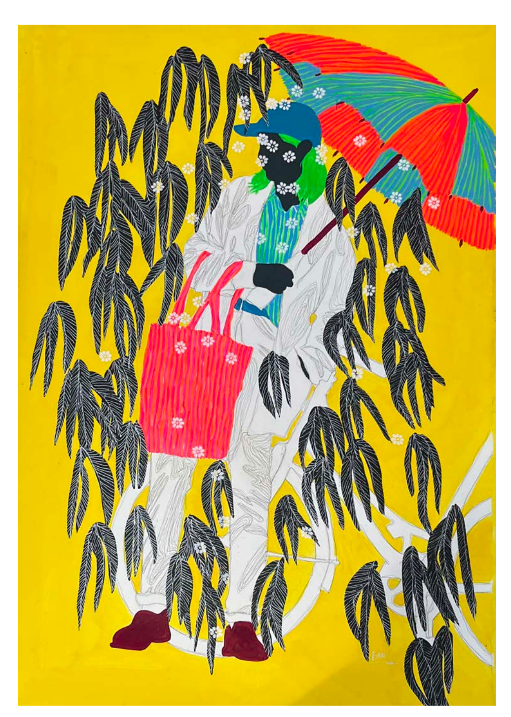
APRÈS LA PLUIE, 2022 Acrylic and pen on canvas 150x100 cm / 59x39 in