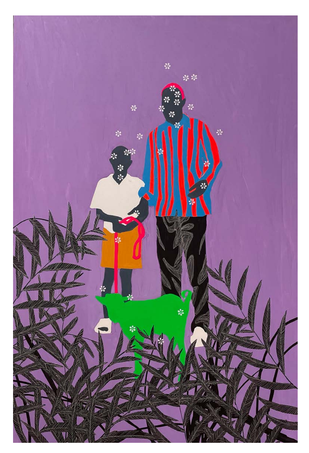
JOUR DE LOUMO BALIII, 2021 Acrylic and posca on canvas 180x120 cm / 71x47 cm