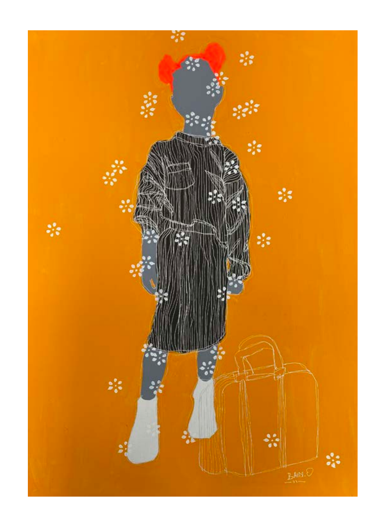
LEFT SANS TITRE, 2022 Acrylic and pen on canvas 85x60 cm / 33x24 in

RIGHT SUR MA ROUTE 2, 2022 Acrylic and pen on canvas 85x60 cm / 33x24 in