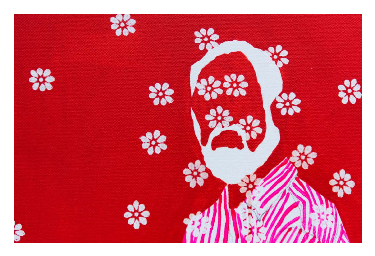
AU DESSUS DE NOS POUBELLES , 2022 (DETAIL)