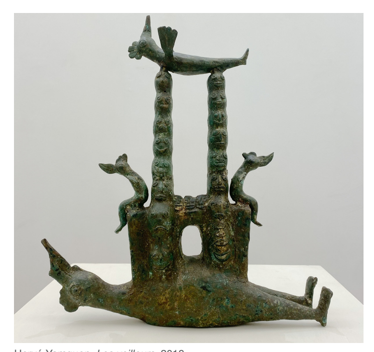
Hervé Yamguen. Les veilleurs , 2018 Bronze. Courtesy of AFIKARIS Gallery and the artist.

LES MONDES DE L'OISEAU CONTEUR Hervé Yamguen 3 February – 16 March