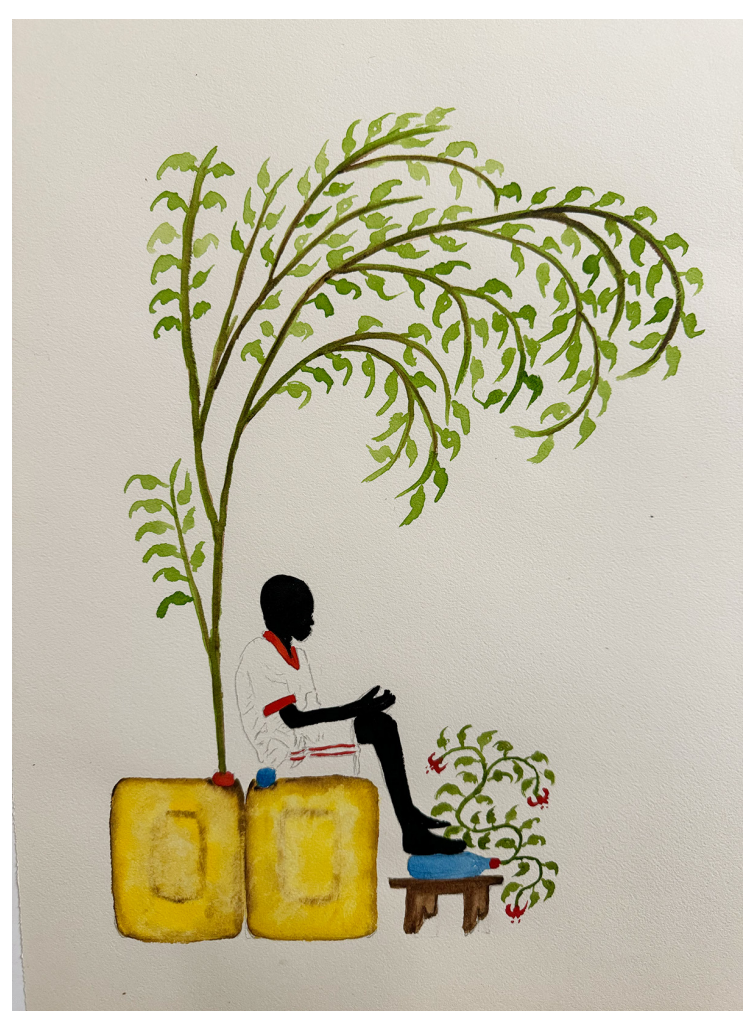
Above. Saïdou Dicko. Le tabouret, 2023. Watercolour on paper. 40x30 cm / 16x12 in. Courtesy of AFIKARIS Gallery and the artist.

On photographic paper, Saïdou Dicko covers the silhouettes of the children with black ink, transforming them into shadows. Becoming anonymous characters, their identity is limited only by their imagination. The world belongs to them. Behind them, the artist superimposes floral fabrics using his digital brushes, leaving only the main weave. The threads follow the movement of the figures, offering the stories an intimate and unique frame.