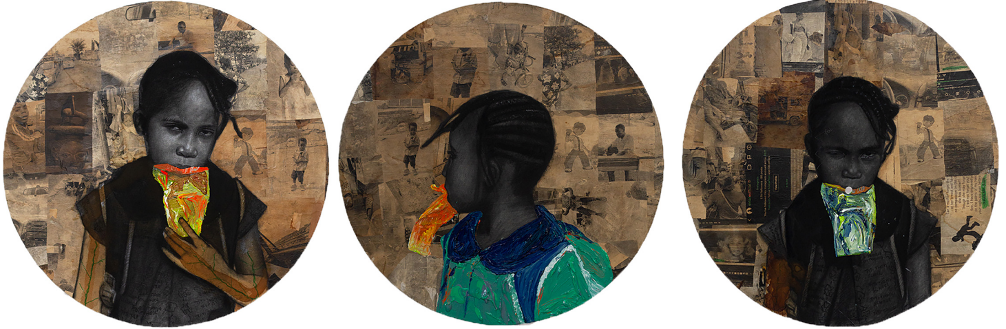
Left. Emma Odumade, Three Sides of a Coin , 2022. 75x75 cm. Charcoal, acrylic, ink, black tea and ols photos on canvas. Centre. Three Sides of a Coin III , 2022. 75x75 cm. Charcoal, acrylic, ink, black tea and ols photos on canvas. Right. Emma Odumade, Three Sides of a Coin II , 2022. 75x75 cm. Charcoal, acrylic, ink, black tea and ols photos on canvas.

depicts a scene in which a change is taking place. As I Reflected materialises the concept of transition. In this sense, the shape of some of the works - circular or inclined - as well as the posture of the moving characters, provides a sensation of impulse and suggests movement.