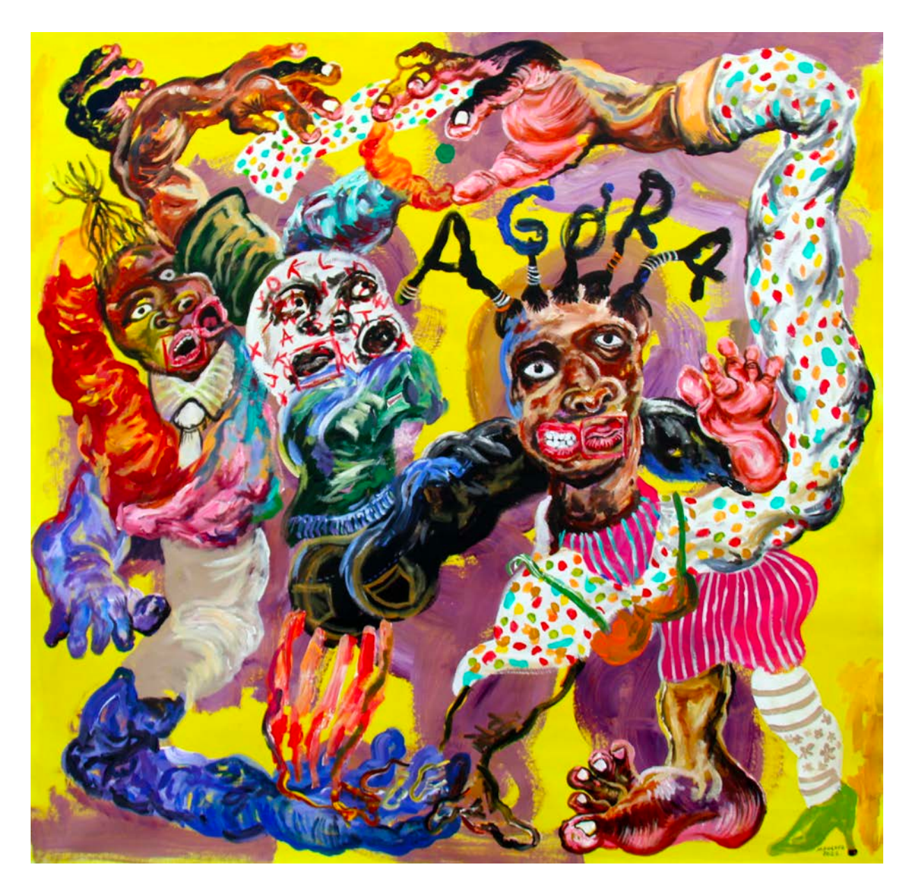
AGORA, 2021 Acrylic on canvas 120x120cm / 47x47 in