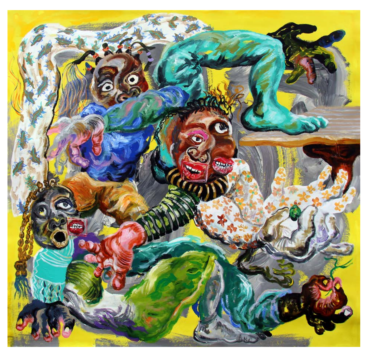
LES SAUVEURS DU PROTOTYPE, 2021 Acrylic on canvas 120x120cm / 47x47 in