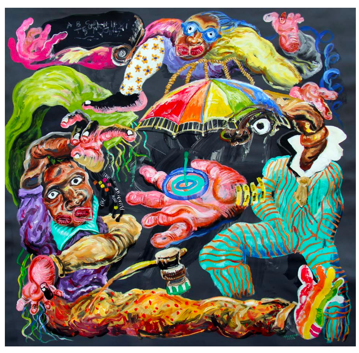
LES JUSTICIERS DE LA NATURE, 2021 Acrylic on canvas 120x120cm / 47x47 in