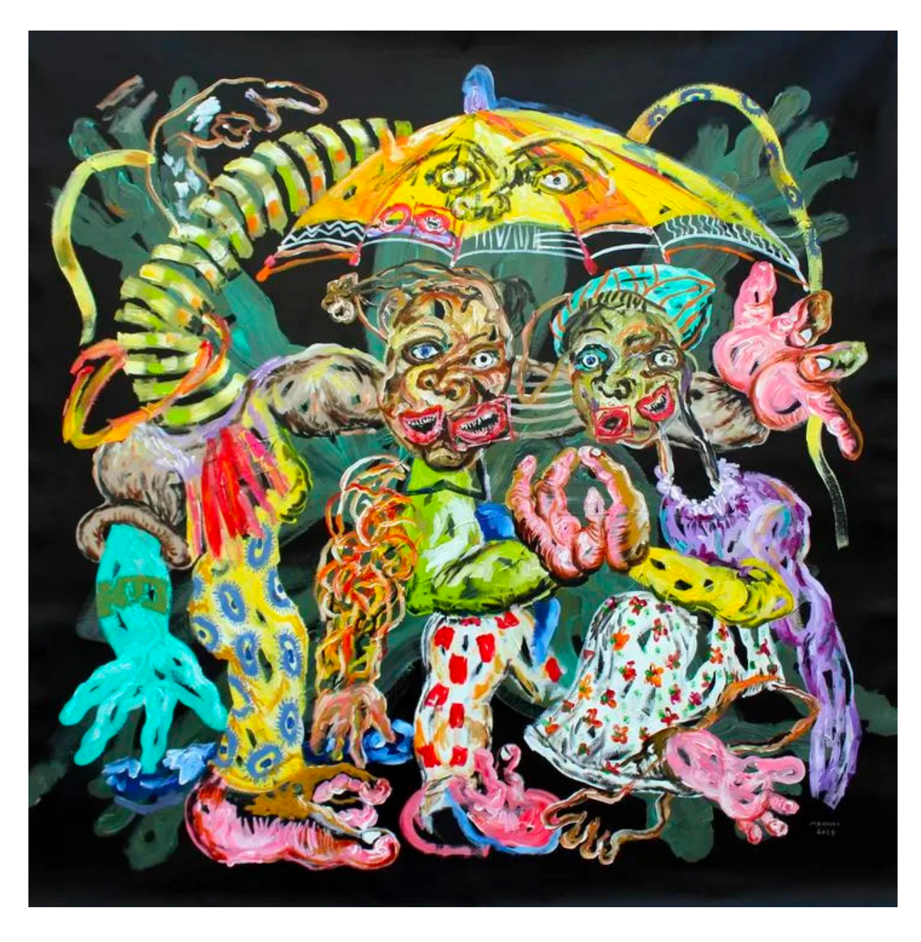
COUPLE BAKONGO 1, 2019 Acrylic on canvas 120x120 cm / 47x47 in