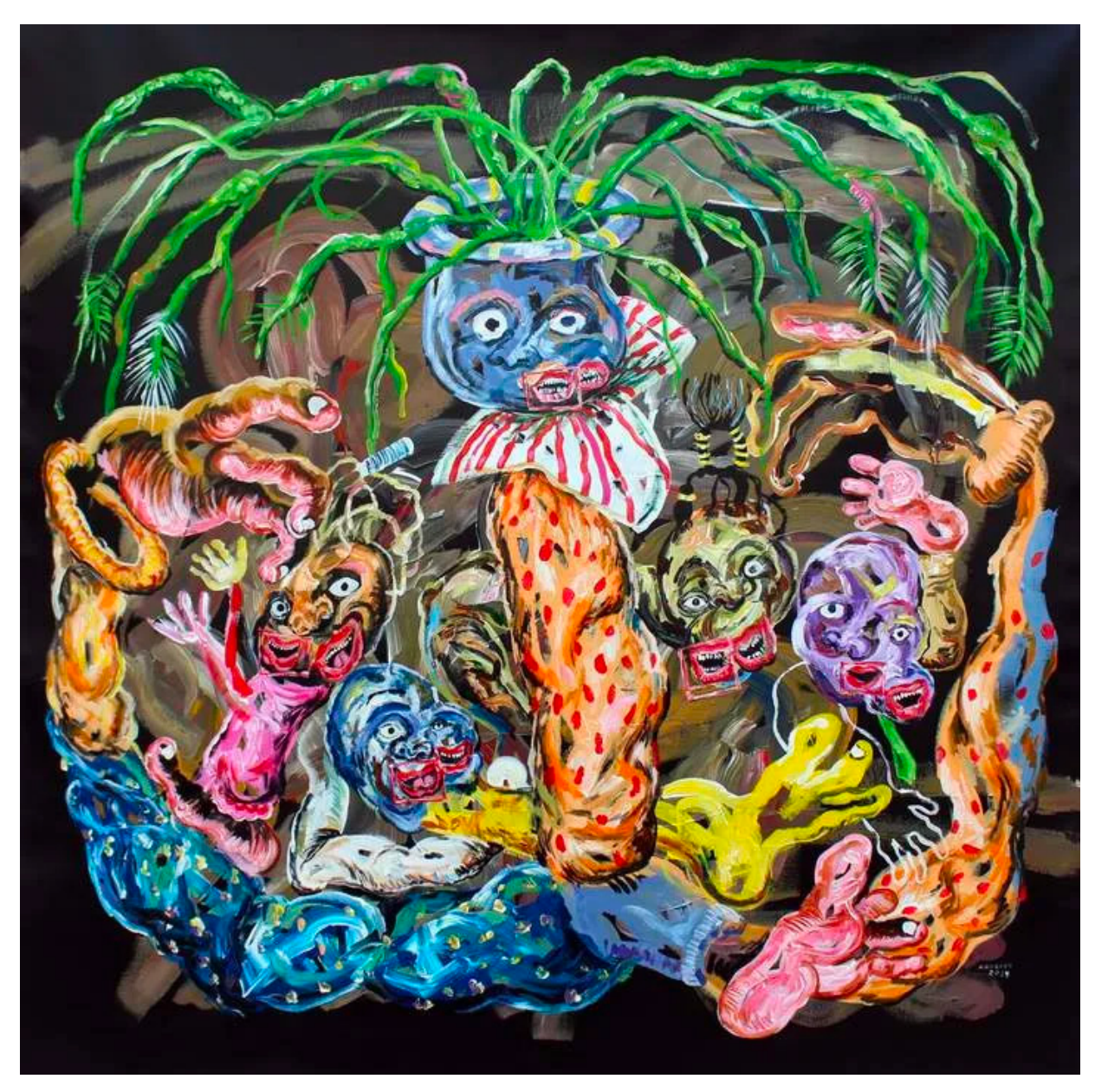
ZONE VERTE, 2019 Acrylic on canvas 120x120 cm / 47x47 in