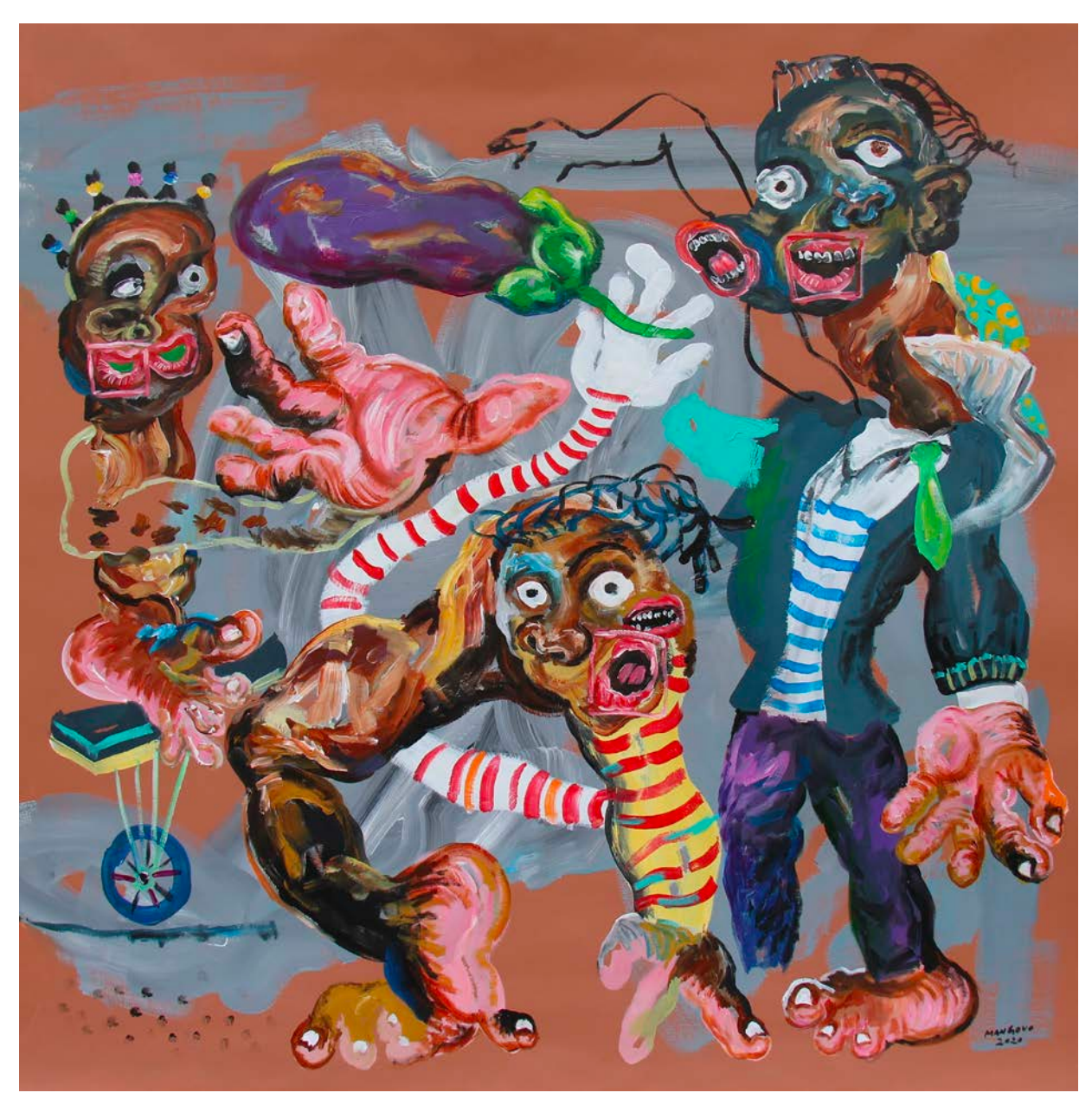
AUBERGINE, 2020 Acrylic on canvas 100x100 cm / 39x39 in