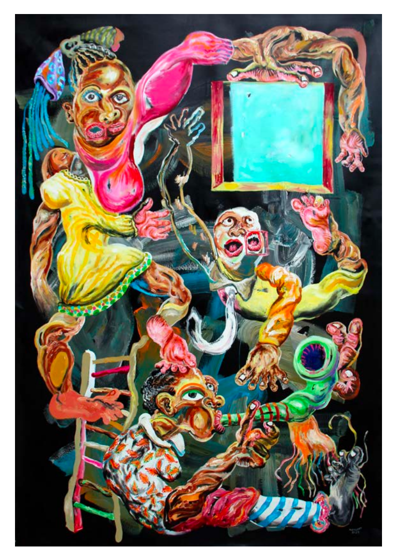
WINDOW OF OPPORTUNITY 1, 2022 Acrylic on canvas 200x135 cm / 79x53 in

In the Window of Opportunity series, Cristiano Mangovo stands in favour of equal opportunity no matter the gender or social class of the individuals. In that way, he puts forward female characters.