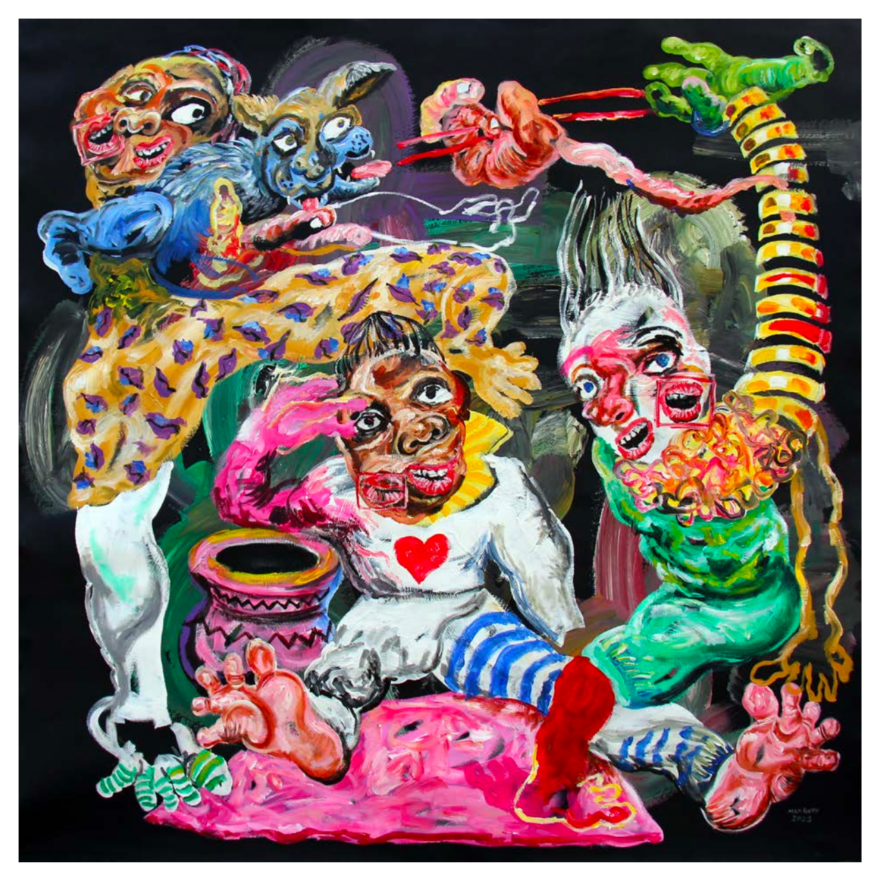
ANY ASSISTANCE!, 2021 Acrylic on canvas 120x120cm / 47x47 in