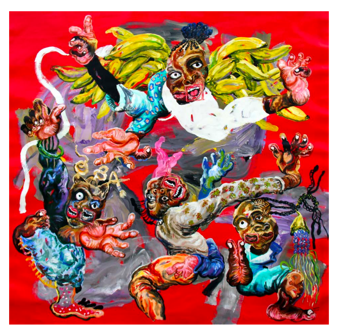
ANGEL OF FERTILITY, 2021 Acrylic on canvas 200x200cm / 79x79 in