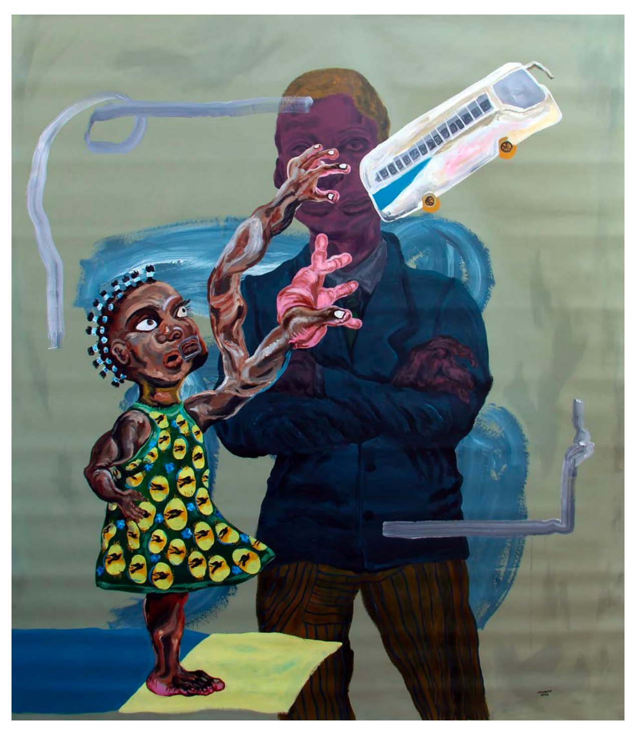
AFRICAN IN UKRAINE, 2022 Acrylic on canvas 180x160 cm / 71x63 in