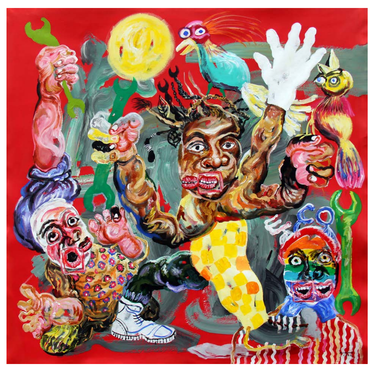
THE REPAIR OF ECOLOGY, 2021 Acrylic on canvas 120x120 cm / 47x47 in