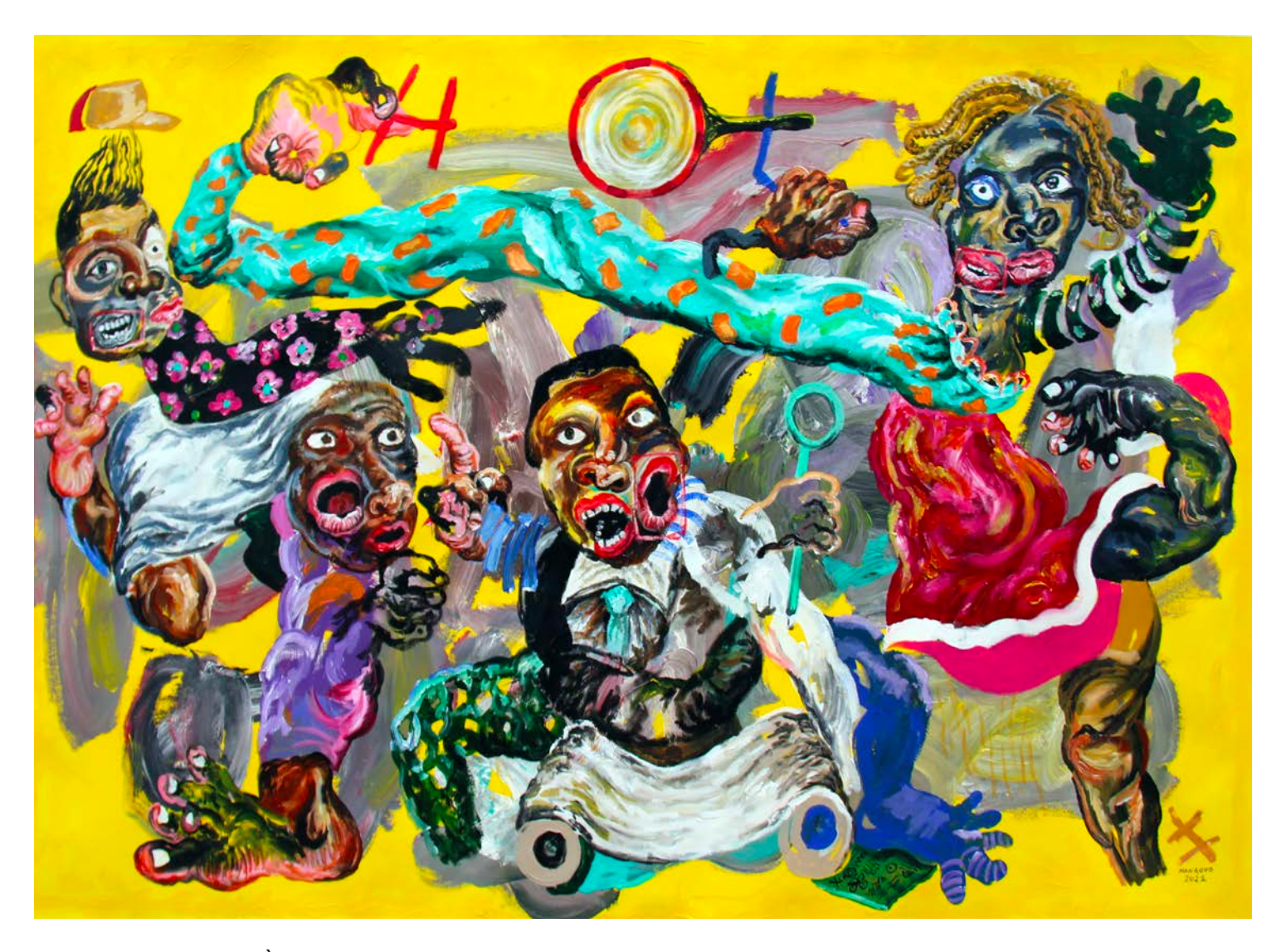
ANALISAR A HISTÒRIA, 2021 Acrylic on canvas 135x200 cm / 53x79 in