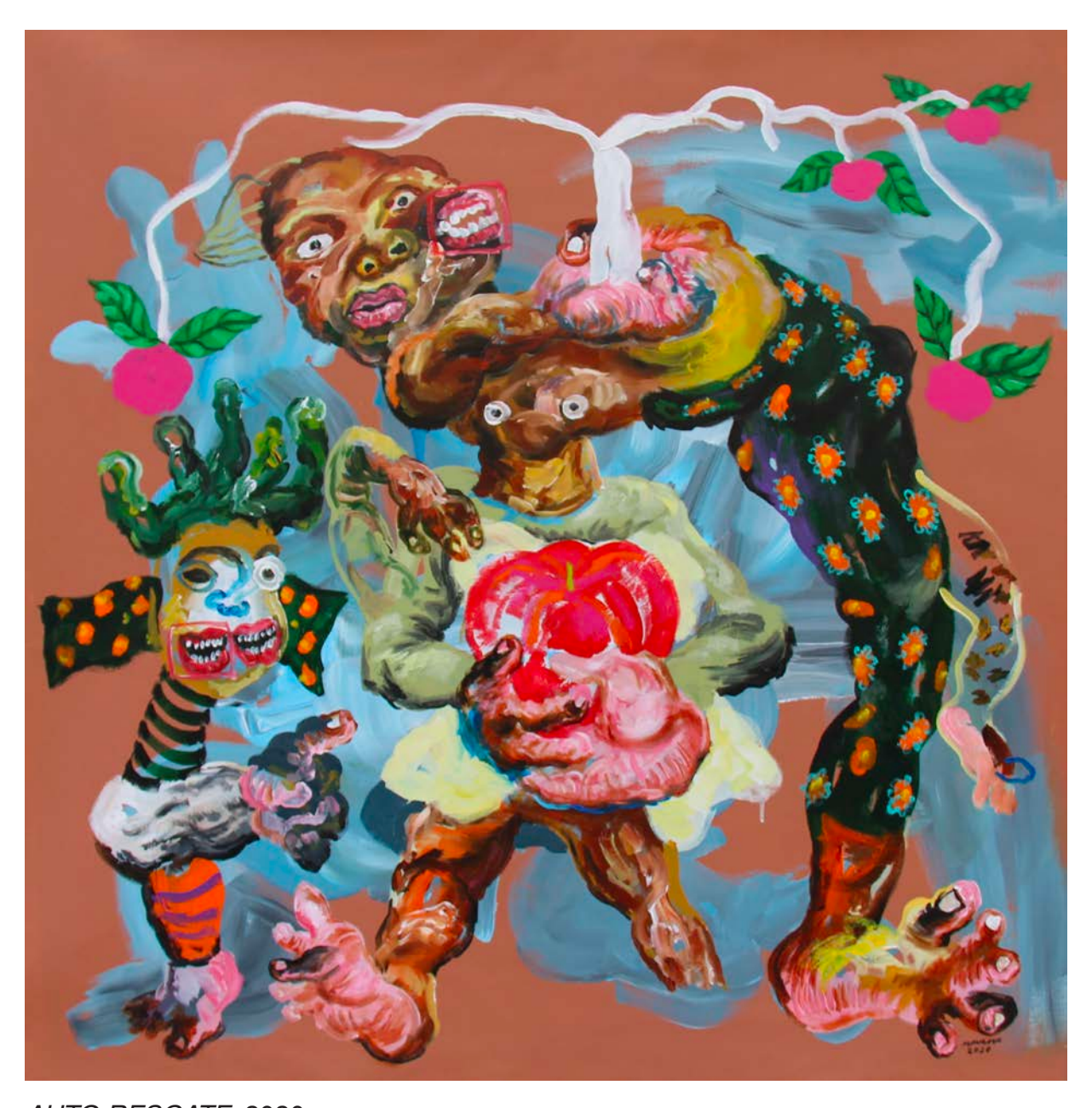
AUTO RESGATE, 2020 Acrylic on canvas 100x100 cm / 39x39 in