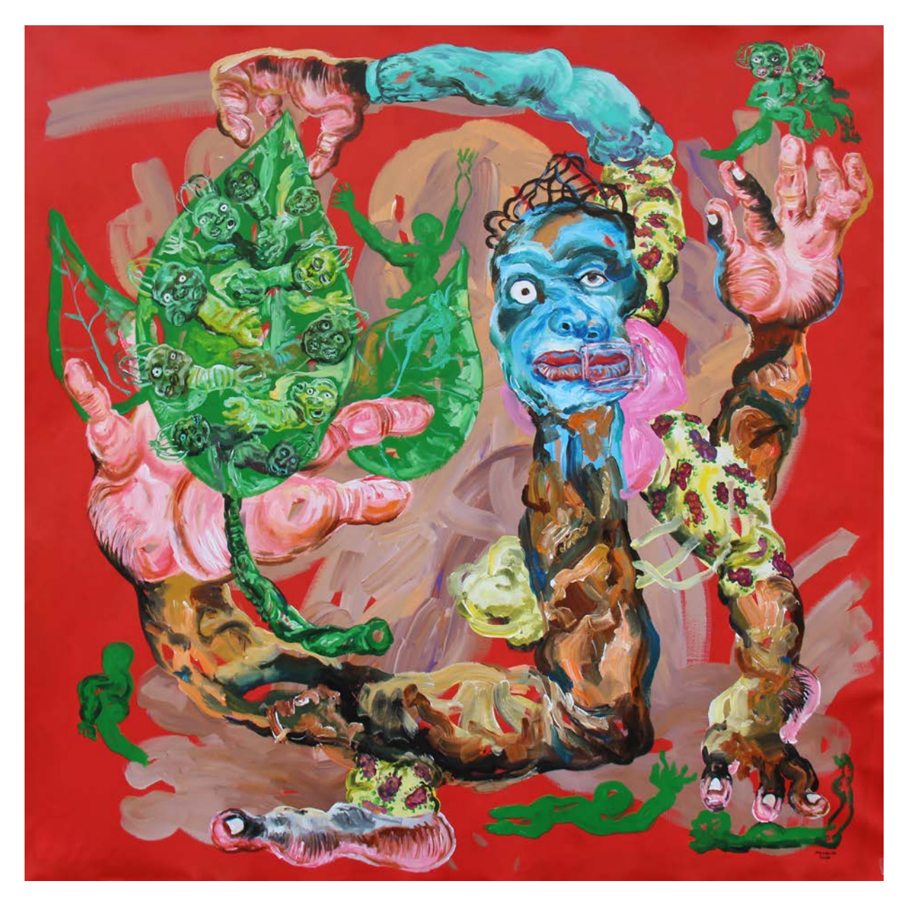
DOMINATION, 2020 Acrylic on canvas 200x200 cm / 79x79 in