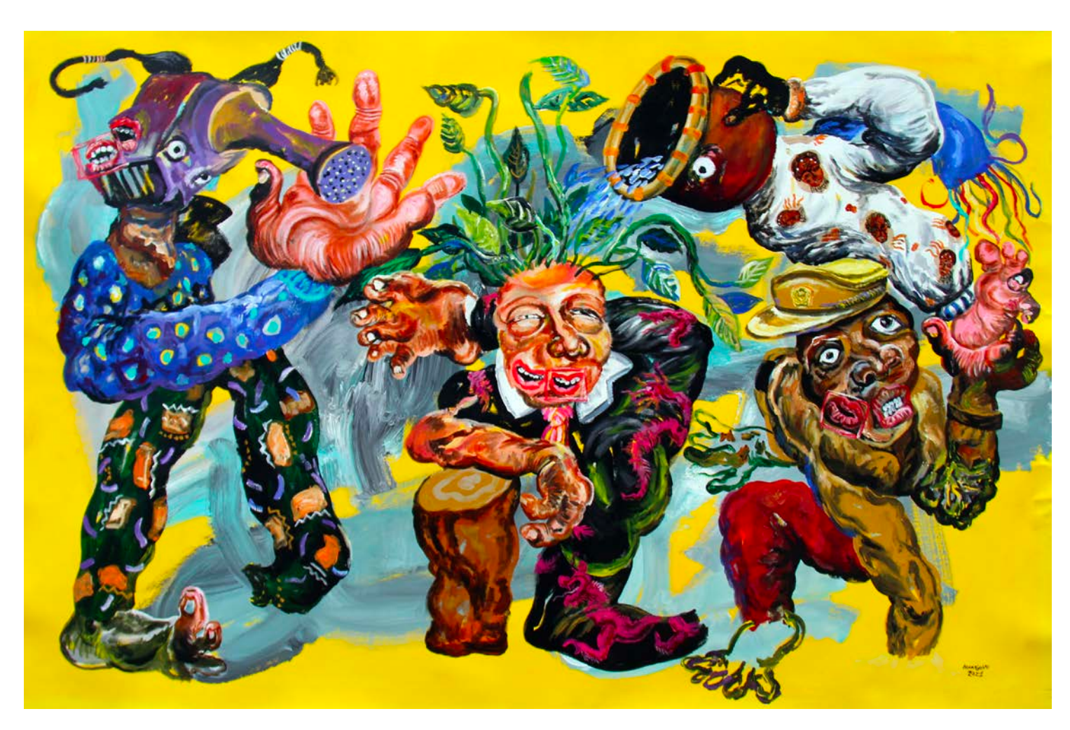
DRAGON VS MWANA MPWO, 2021 Acrylic on canvas 135x200cm / 53x79 in