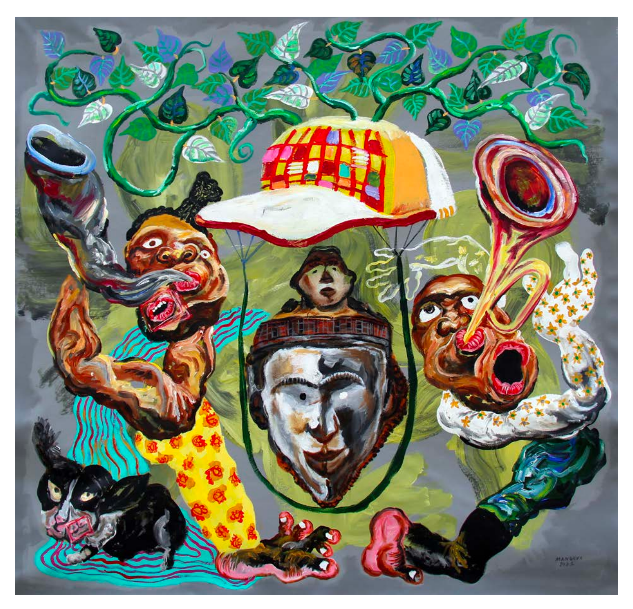
Campanha de proteção, 2021 Acrylic on canvas 120x120cm / 47x47 in

In his series Humano e a Natureza , he initiates a reflection on the position of domination of human beings over nature, as stated in the Bible and accepted for centuries.