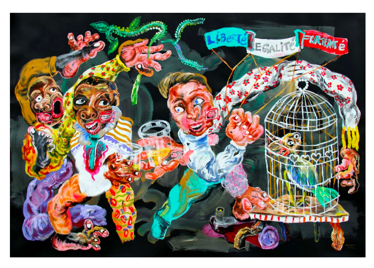
IN THE WORLD OF THE STRONG, 2021 Acrylic on canvas 135x200cm / 53x79 in