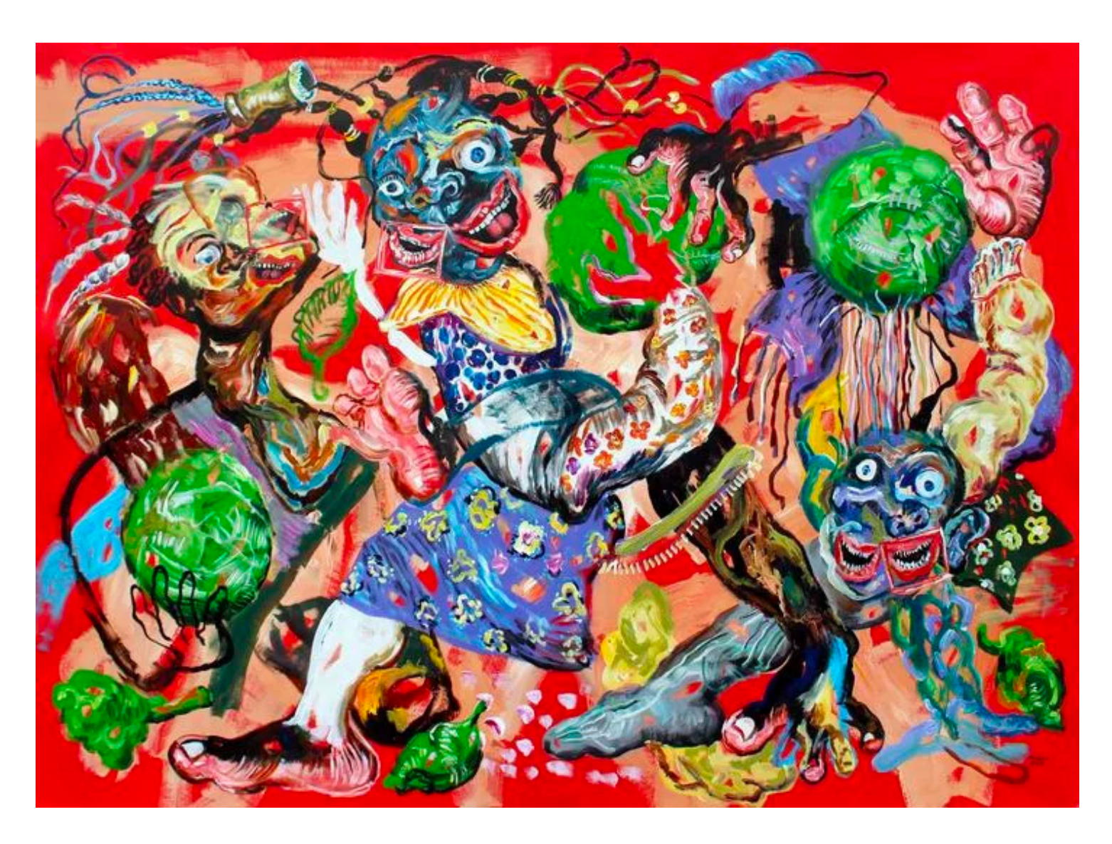
LES ENFANTS AUX CHOUX, 2019 Acrylic on canvas 135x200 cm / 53x79 in