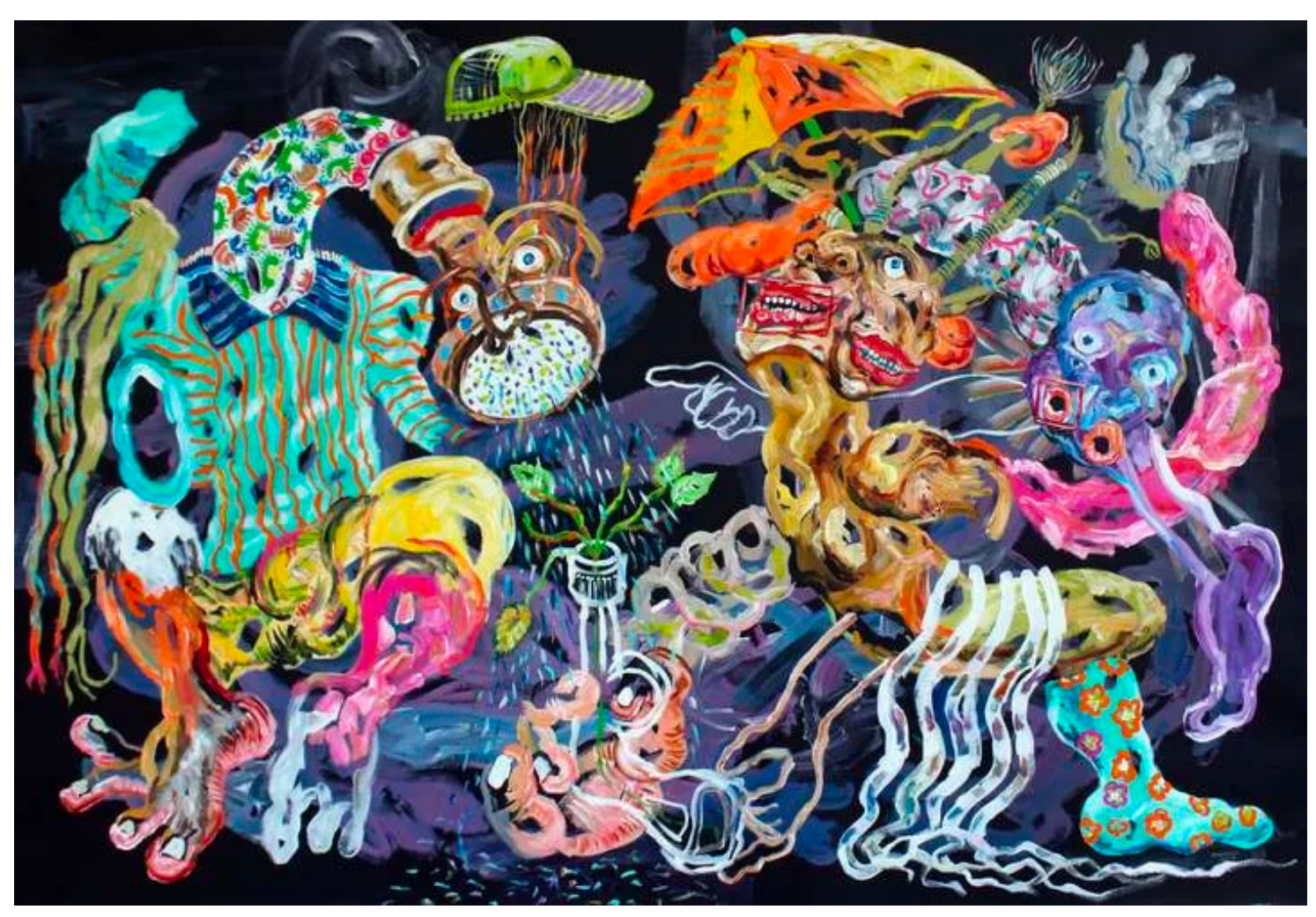
LES ARROSEURS DE LA PAIX, 2019 Acrylic on canvas 135x200 cm / 53x79 in