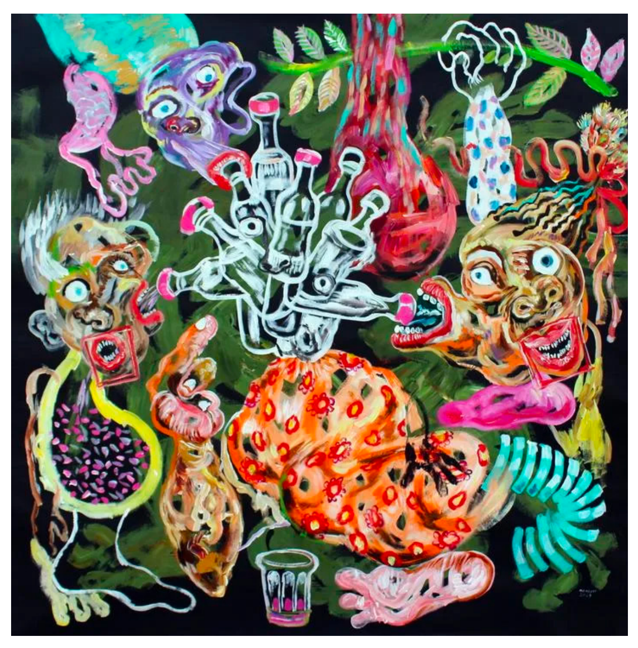
VINHO ROSA, 2019 Acrylic on canvas 120x120 cm / 47x47 in