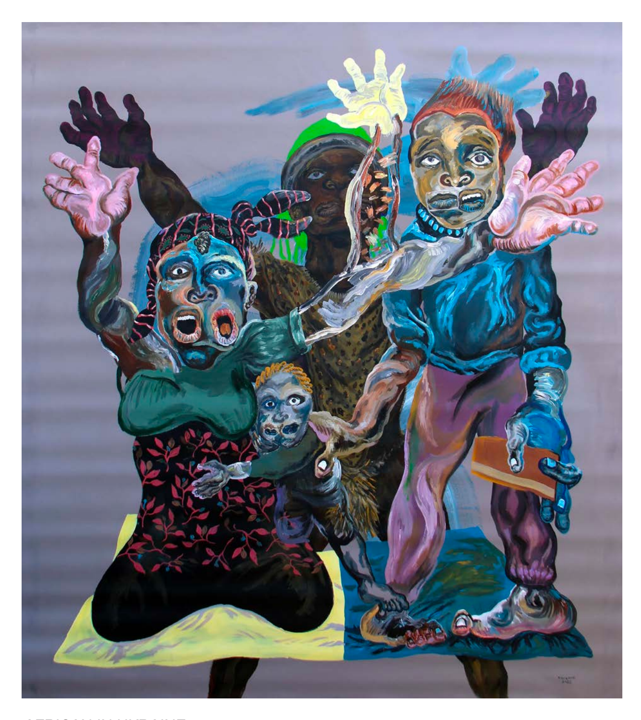
AFRICAN IN UKRAINE 2, 2022 Acrylic on canvas 180x160 cm / 71x63 in