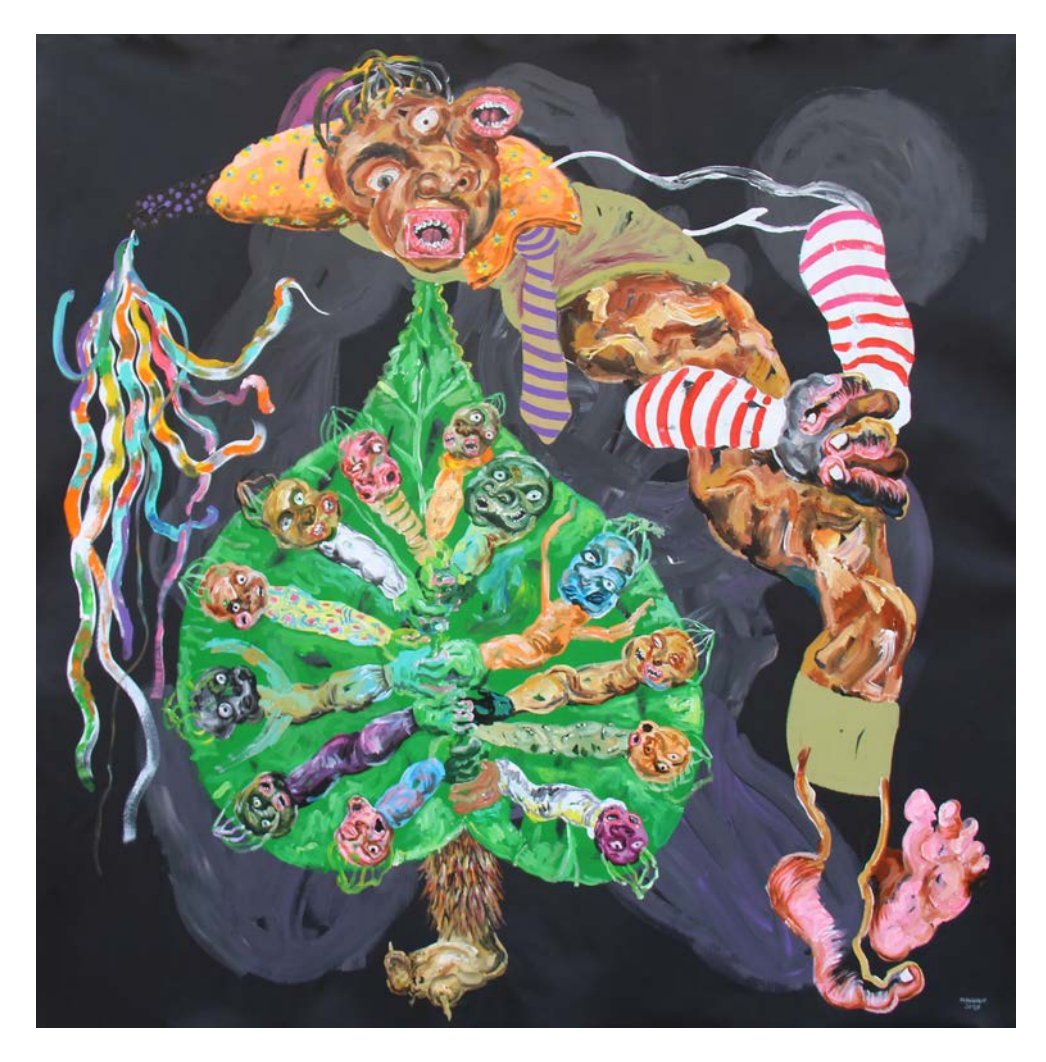
DOMINATION 2, 2020 Acrylic on canvas 200x200 cm / 79x79 in

Cristiano Mangovo deplores the anthropocene and the consequences of human behavior on nature. This is how he rethinks a balanced world where man and nature are in harmony.