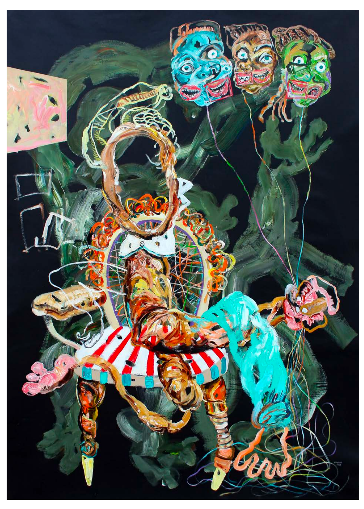
BIG TEAM, 2020 Acrylic on canvas 200x135 cm / 79x53 in