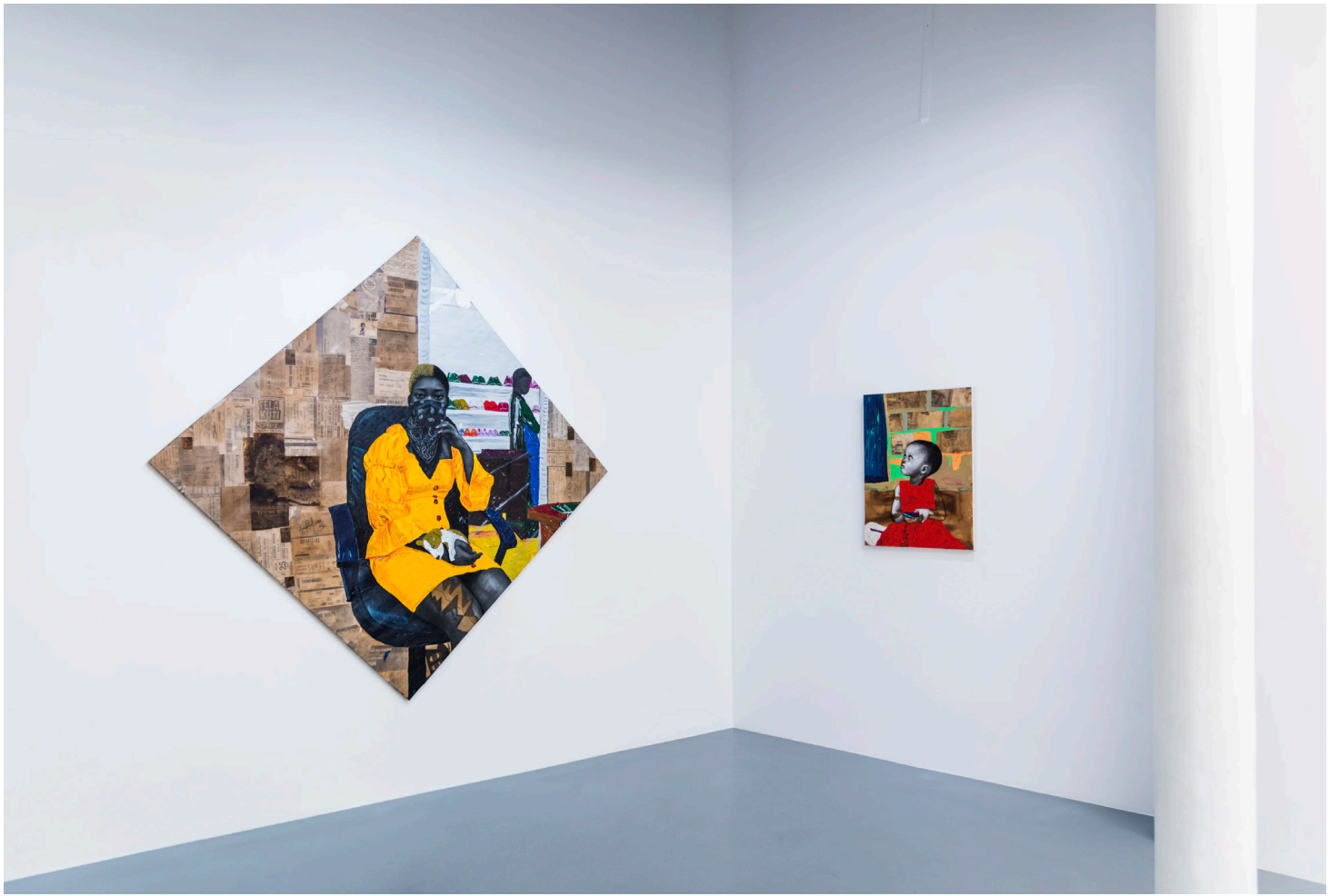
EXHIBITION VIEW As I reflected , AFIKARIS Gallery, Paris, France September 2022