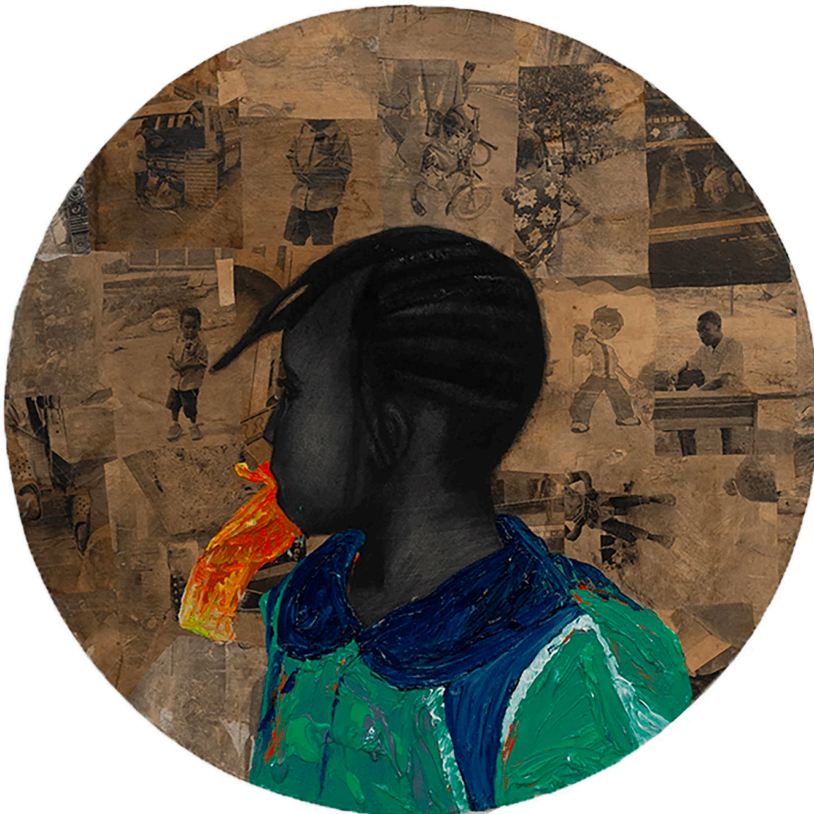
THREE SIDES OF A COIN III , 2022

Charcoal, acrylic, ink, black tea and old photos mounted on canvas