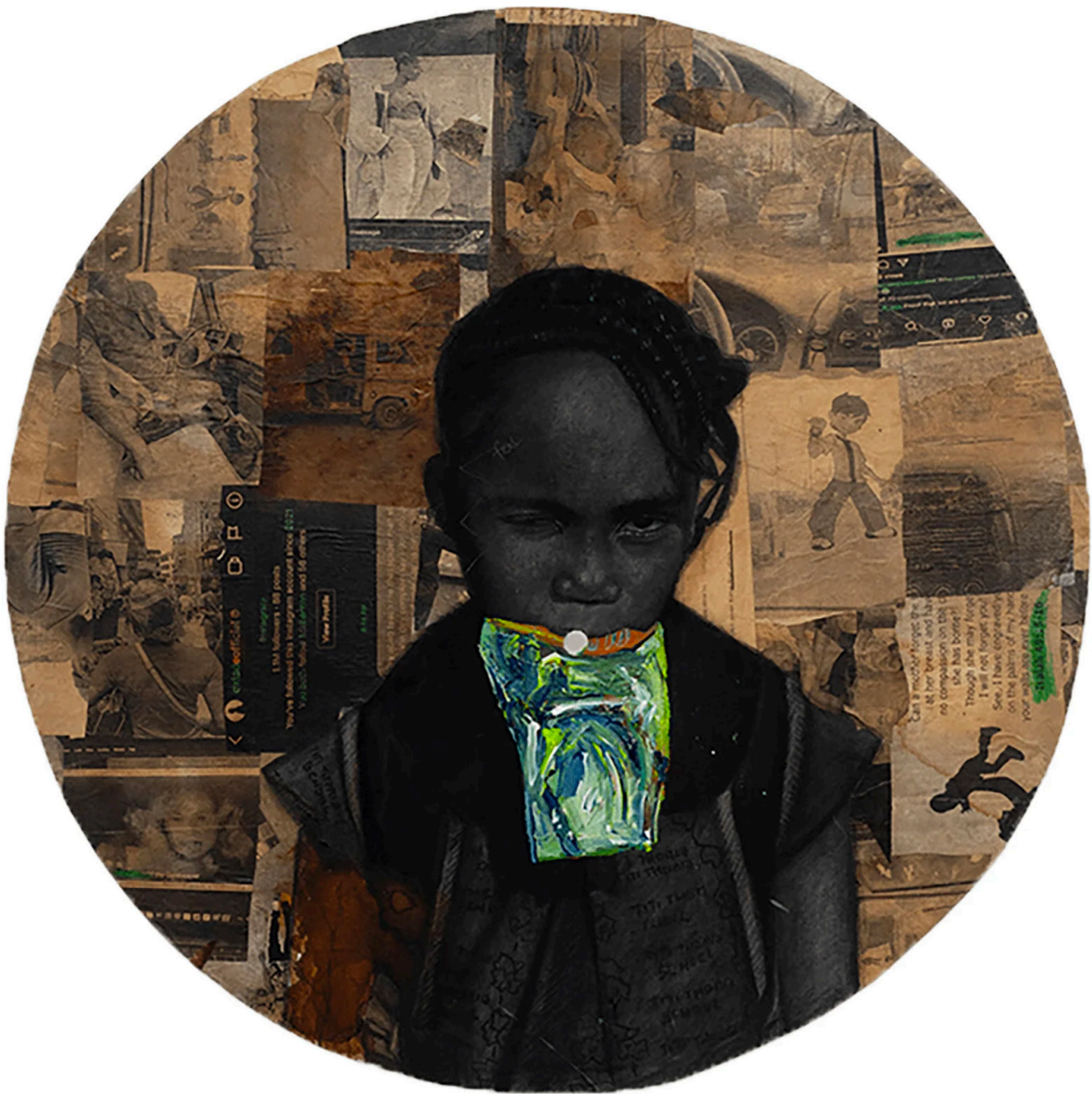
THREE SIDES OF A COIN II, 2022

Charcoal, acrylic, ink, black tea and old photos on canvas