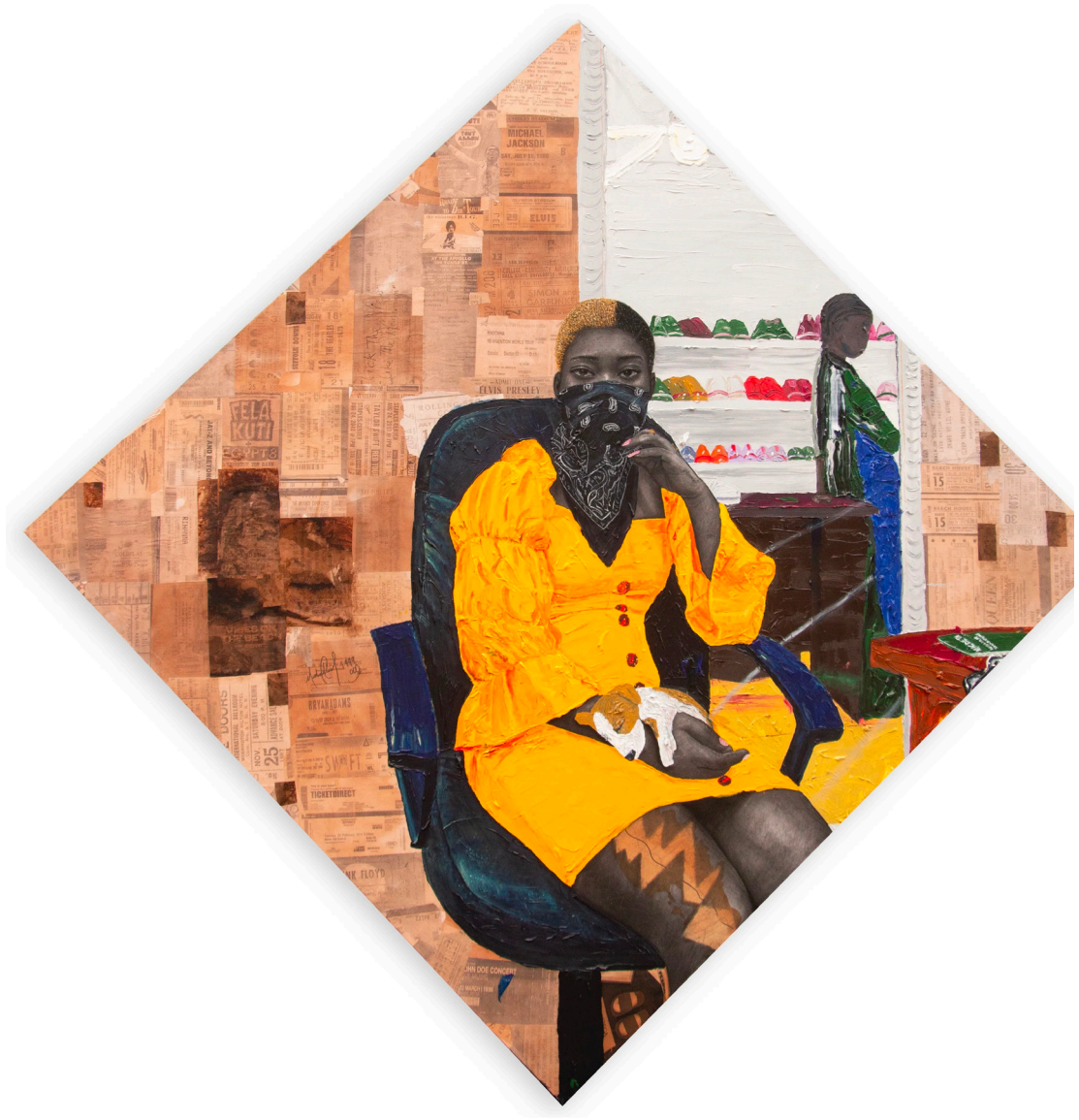
FIRST IMPRESSION, LIKE THE 90'S, 2022

Charcoal, acrylic, ink, black tea, old photos and old tickets on canvas