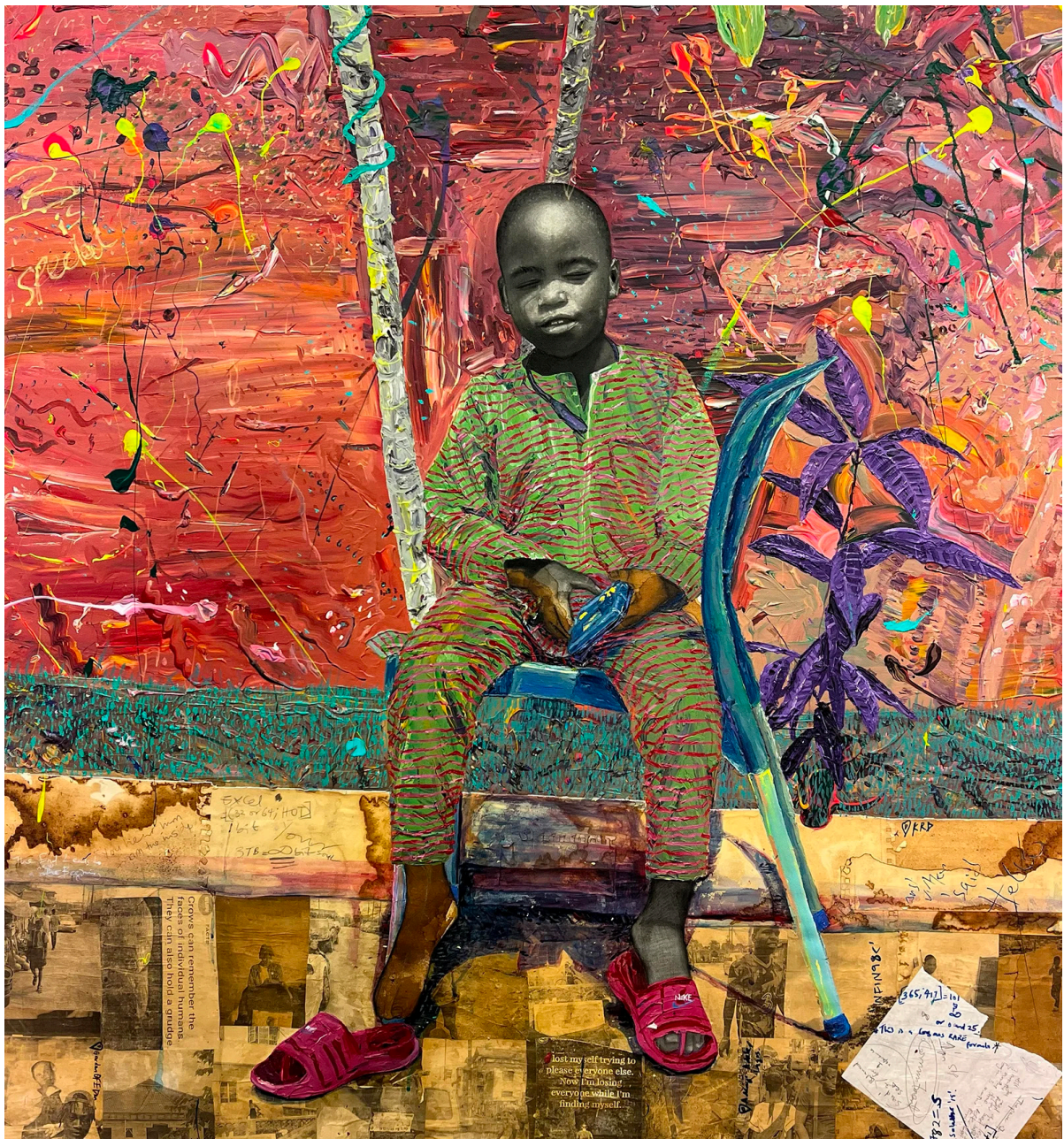
JUST WHEN I SAID HELLO (GAMEBOY), 2021/2022

Charcoal, graphite, acrylic, ink, sketch paper, note, old photos and black tea on canvas 140x130 cm