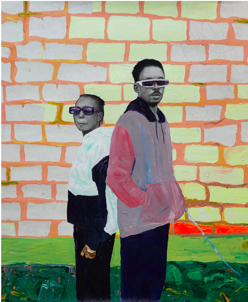
EUPHORIA (NEVER LOW AGAIN) , 2021

Charcoal, graphite, acrylic, sketches and black tea on paper mounted on canvas 140 x 110 cm