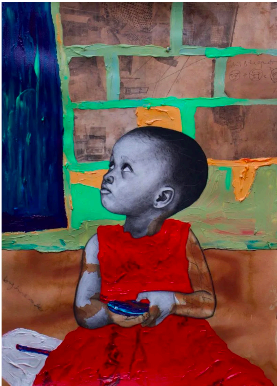
DÉJÀ VU ; GIRL IN SPACE, 2021

Charcoal, graphite, acrylic, old photos and black tea on paper mounted on canvas 80x60 cm 31x24 in