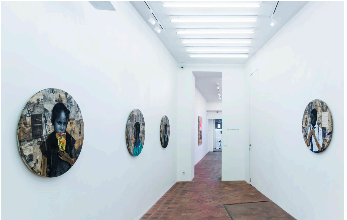
EXHIBITION VIEW As I reflected , AFIKARIS Gallery, Paris, France September 2022