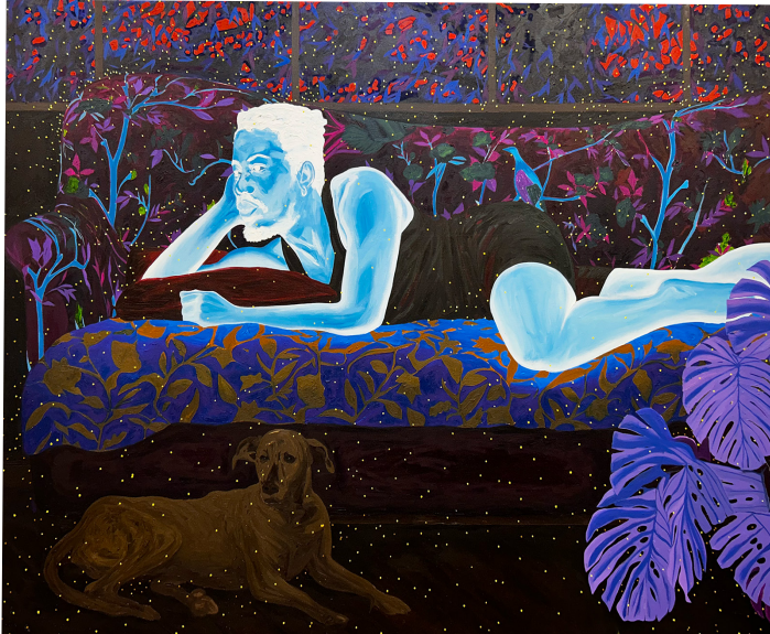
Boluwatife Oyediran. David on a Couch , 2024. Oil and acrylic on canvas. 183x244 cm