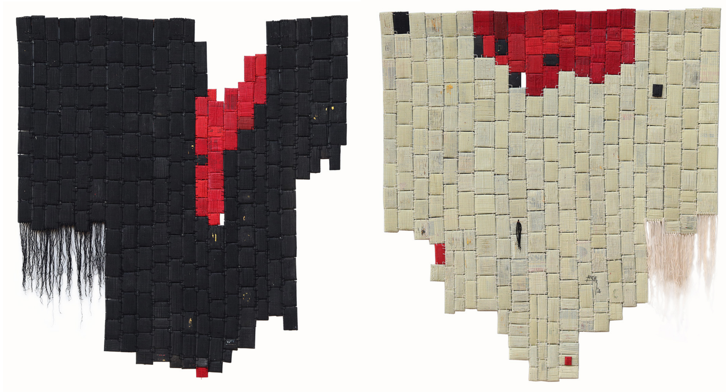
Left. Ange Dakouo. Convergence #1 , 2024. Mixed media (cardboard, newspapers, cotton thread and acrylic). 164x152 cm.

The project that Ange Dakouo has devised for his second solo exhibition in Paris - the first, Pensées du tremblement, took place at Fondation H in September 2023 following a residency at the Cité internationale des arts - vibrates to the sound of Charlie Chaplin's voice. The last speech from The Great Dictator echoes through the space, mingling his words with those of the artist, who themselves are revealed on the walls. From 17 October to 23 November, Ange Dakouo's wall tapestries of gris-gris made of newspaper and thread will take over the AFIKARIS gallery's Project Room in an immersive installation entitled Ce rythme, mon Esprit, une discorde.