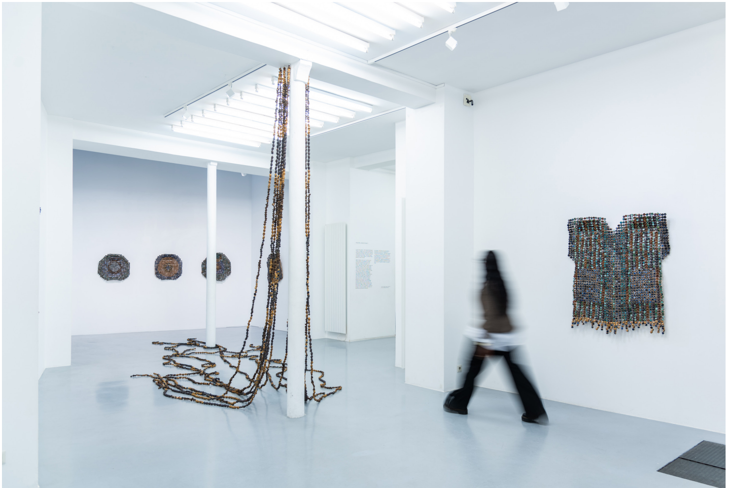
Above. View of the AFIKARIS gallery located at 7 rue Notre-Dame-de-Nazareth

AFIKARIS' programme includes group and solo exhibitions, art fairs, publications, an artistic residency and institutional partnerships.